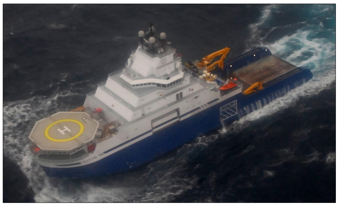
Figure A-8. Commercial Ship Aiviq

Source: Cropped version of photograph accompanying "Aiviq," Wikipedia, accessed April 29, 2022, which states that the photograph is dated December 30, 2012, and credits the photograph to U.S. Coast Guard Petty Officer 3rd Class Chris Usher.