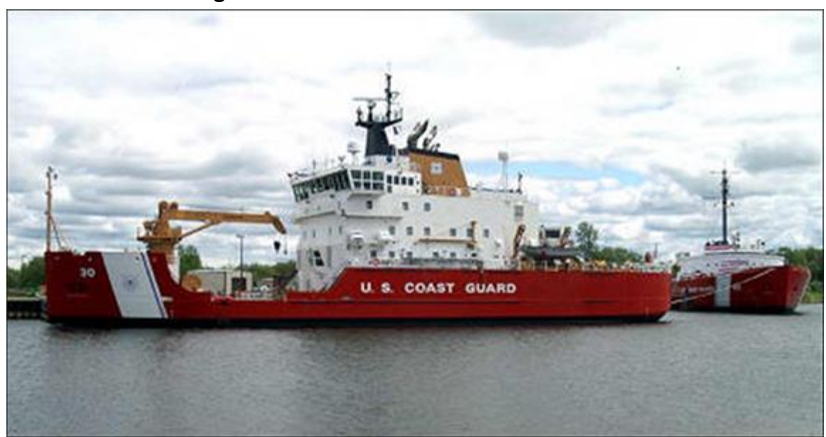
Figure C-1. Great Lakes Icebreaker Mackinaw