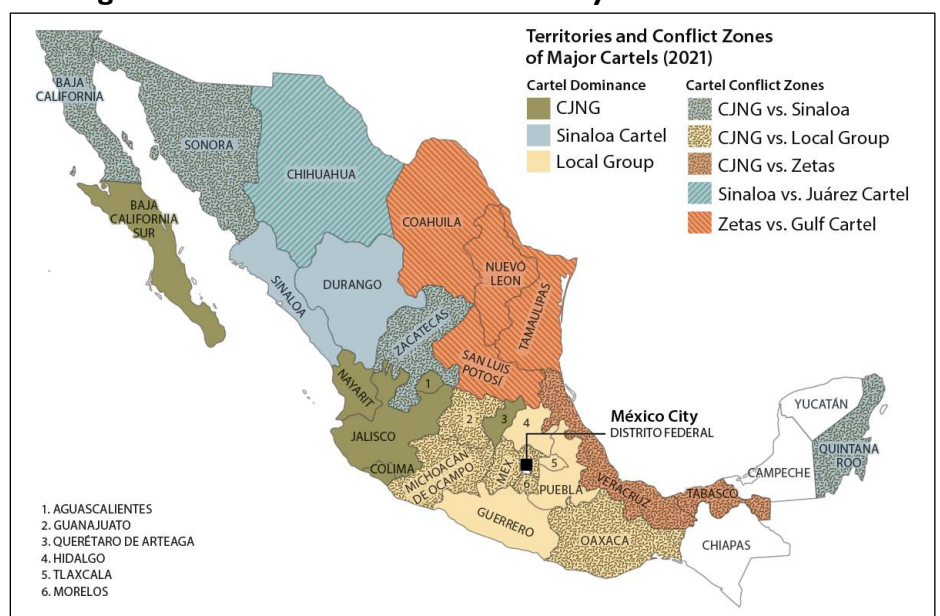
Figure 2. 2021 Mexican Cartel Territory and Conflict Zones

Figure 2 maps the territories dominated and disputed by major cartels from data gathered by Latin America regional analyst James Bosworth from open sources and journalist interviews. The figure shows five major competitors or large cartels: CJNG, Sinaloa, Juárez, Gulf, and Los Zetas, each by their areas of dominance and contested areas. Local group challenges shown in central and western Mexico come from cartel fragments or new offshoots of groups that are among the nine organizations profiled in this report, such as La Familia Michoacana . For another way to envision the TCO territories and conflicts, the political risk firm Stratfor Worldview (previously Stratfor) provides a geographic mapping (see Figure 3 ) of Mexico's 12 major cartels. This depiction has evolved from a previous Stratfor conceptualization of cartel territories within regional groupings.