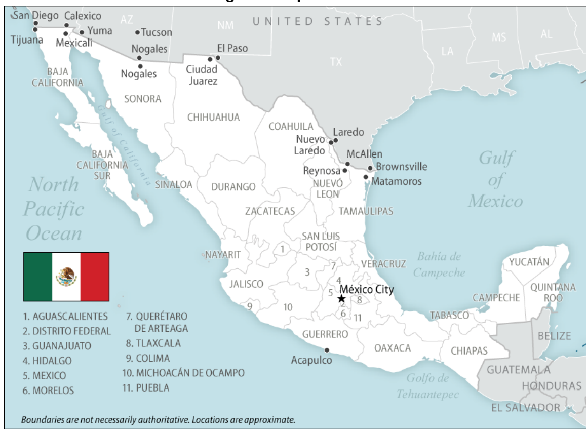
Figure 1. Map of Mexico

In March 2022, a large weapons seizure convinced some analysts of an accelerating "internal" war within the Sinaloa Cartel, Mexico's oldest and most dominant TCO.<sup>14</sup> Reportedly, police found in safe houses in Sonora gear that included millions of rounds of high-powered ammunition, what appeared to be fully automated machine guns, bulletproof vests, and other weaponry. Police suspected this gear had been stashed for combat between cartel factions (see below, "Sinaloa DTO" section), as well as for the ongoing power struggle with external competitors.<sup>15</sup>