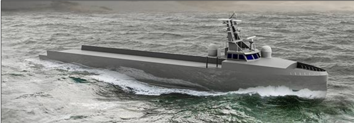
Figure 6. Rendering of L3Harris Design Concept for MUSV