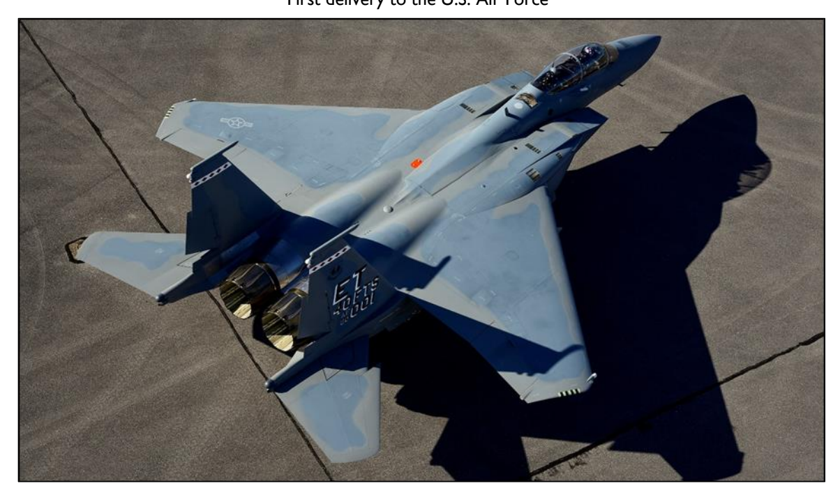
Figure I.F-I5EX Eagle II First delivery to the U.S. Air Force

The Air Force received its first F-15 Eagle air superiority fighter in 1974. Subsequently, the F-15 evolved to encompass more roles, most notably with the deployment of the F-15E Strike Eagle in 1989. The F-15E added substantial air-to-ground capability, including a second cockpit for a weapons systems officer. The Air Force has 453 F-15s of all variants, the newest of which, an F-15E, was ordered in 2001. Following the last U.S. order, F-15s have continued in production for a variety of international customers, including (among others) Israel, Saudi Arabia, and Japan.