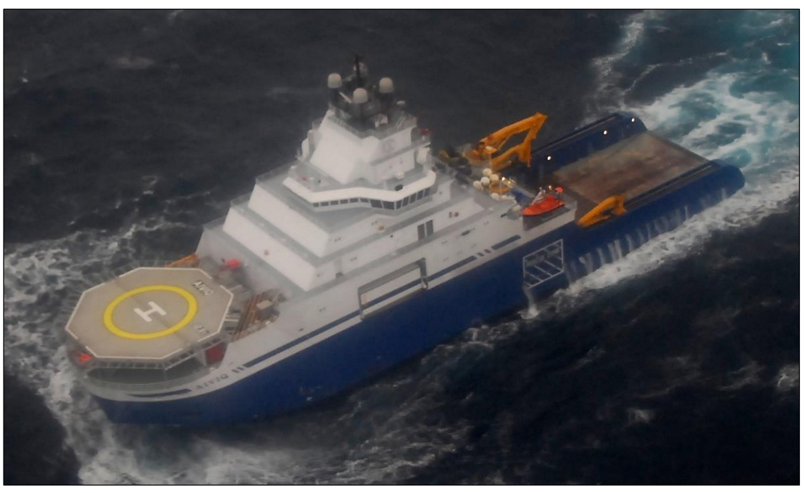
Figure A-8. Commercial Ship Aiviq

Source: Cropped version of photograph accompanying "Aiviq," Wikipedia, accessed April 29, 2022, which states that the photograph is dated December 30, 2012, and credits the photograph to U.S. Coast Guard Petty Officer 3rd Class Chris Usher.