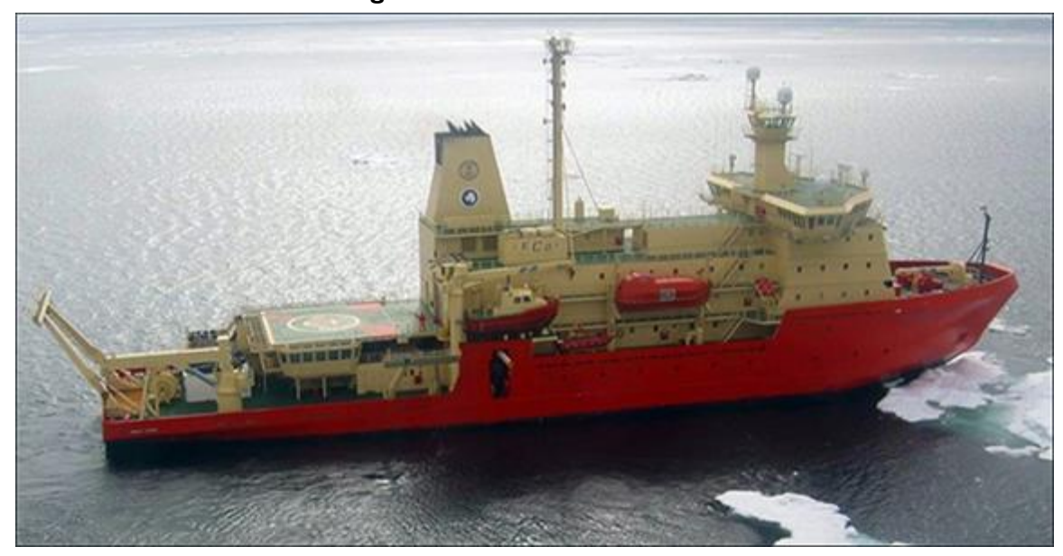
Figure A-4. Nathaniel B. Palmer

Nathaniel B. Palmer ( Figure A-4 ) was built for the NSF in 1992 by North American Shipbuilding, of Larose, LA.