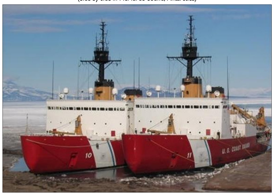
Figure A-1. Polar Star and Polar Sea (Side by side in McMurdo Sound, Antarctica)

Polar Star (WAGB-10) and Polar Sea (WAGB-11),<sup>55</sup> sister ships built to the same general design ( Figure A-1 and Figure A-2 ), were acquired in the early 1970s as replacements for earlier U.S. icebreakers. They were designed for 30-year service lives, and were built by Lockheed Shipbuilding of Seattle, WA, a division of Lockheed that also built ships for the U.S. Navy, but which exited the shipbuilding business in the late 1980s.