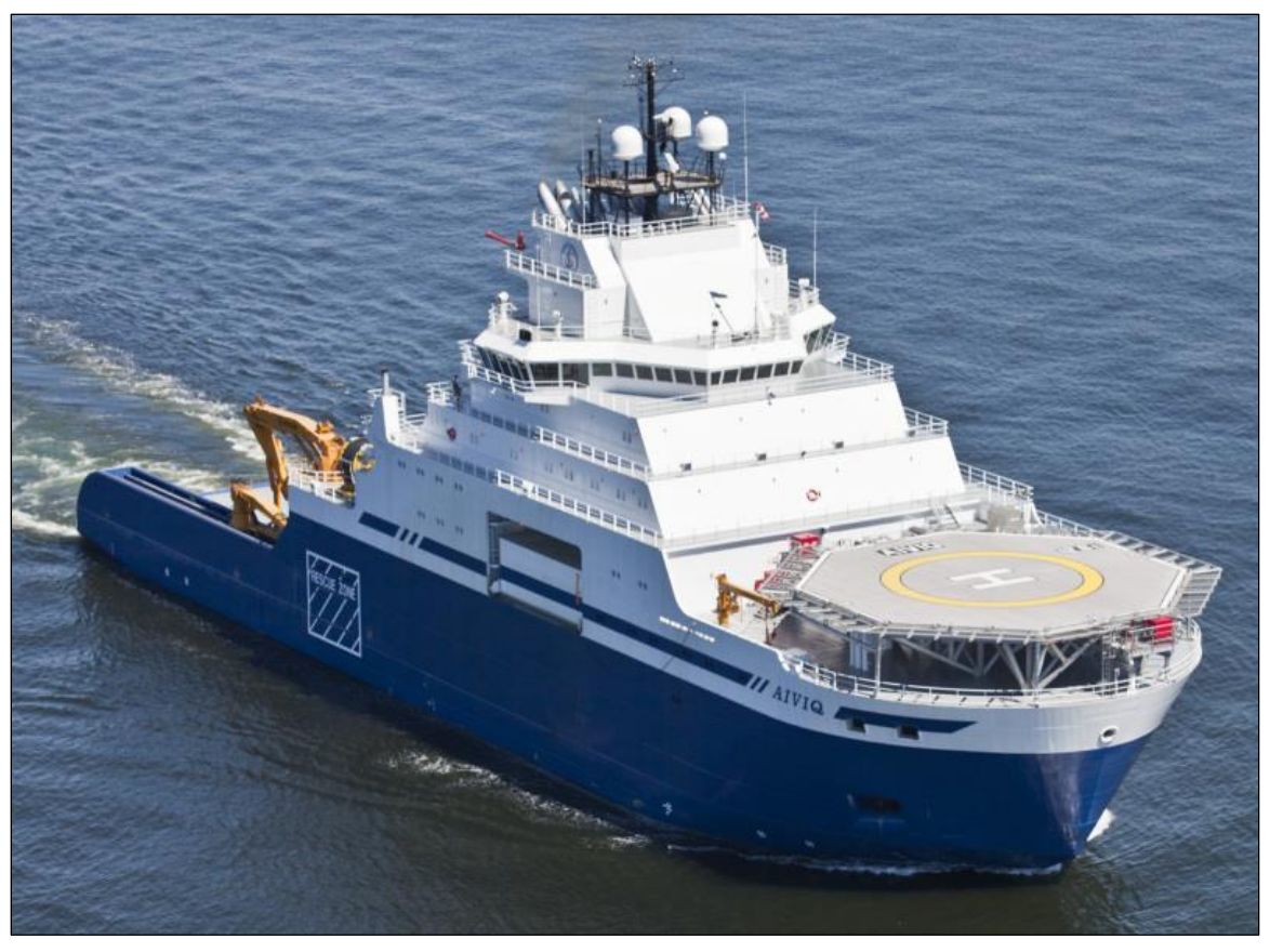
Figure A-7. Commercial Ship Aiviq