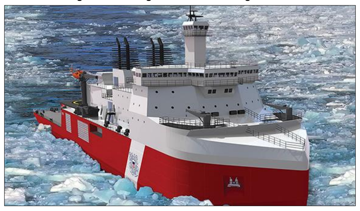
Figure 4. Rendering of Halter Marine Design for PSC