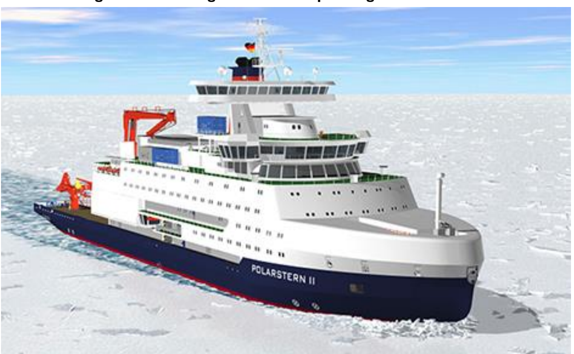
Figure 5. Rendering of SDC Concept Design for Polarstern II