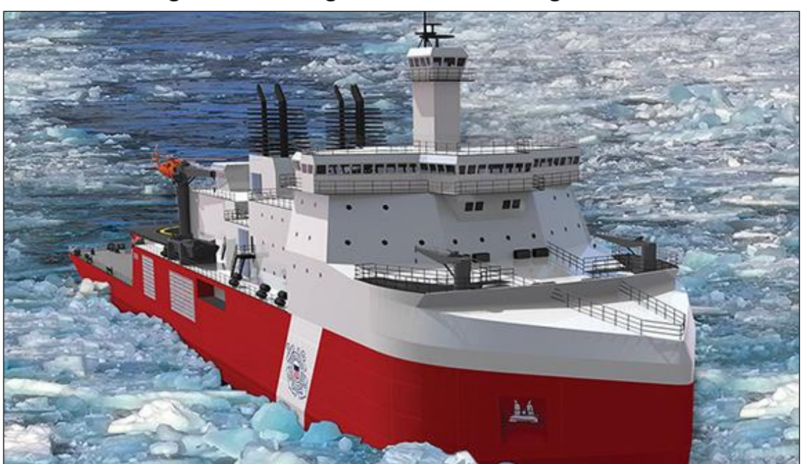
Figure 4. Rendering of Halter Marine Design for PSC