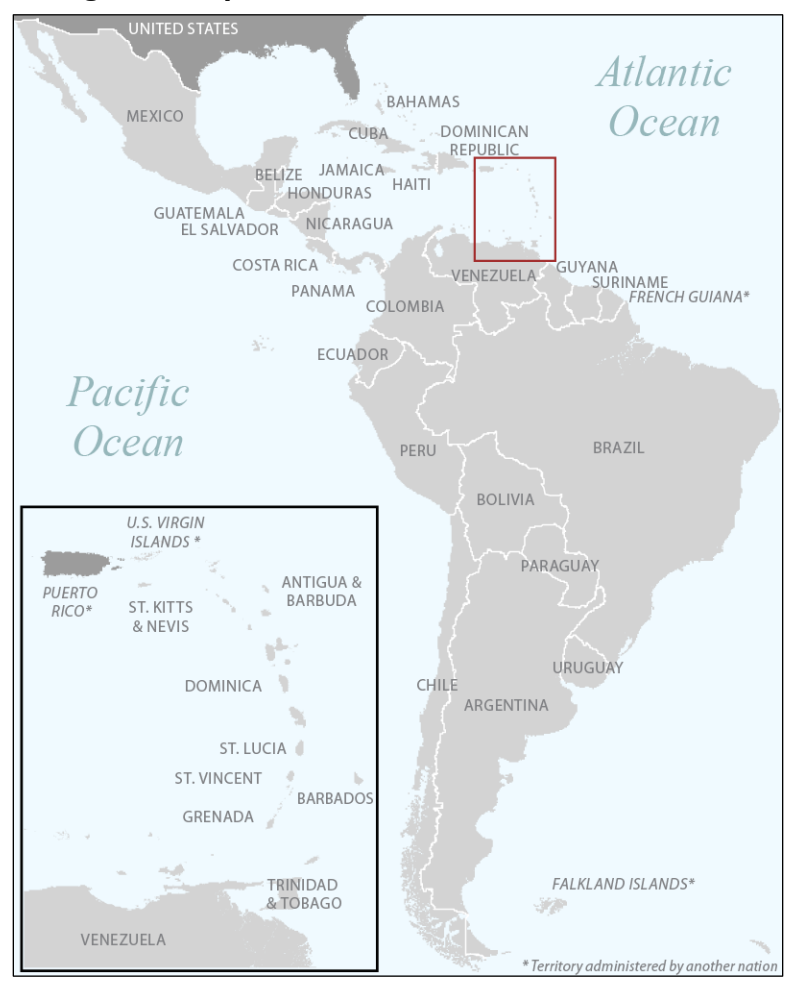
Figure 1. Map of Latin America and the Caribbean

Foreign assistance (also referred to as foreign aid in this report) is one of the tools the United States employs to advance U.S. interests and policy goals in Latin America and the Caribbean.<sup>1</sup> The focus and funding levels of aid programs change along with broader U.S. objectives. Current aid programs reflect the diverse needs of the countries in the region, as well as the broad range of these countries' ties to the United States (see Figure 1 for a map of Latin America and the Caribbean). Some countries receive U.S. assistance across many sectors to address political, socioeconomic, and security challenges. Others have made major strides in consolidating democratic governance and improving living conditions; these countries no longer receive traditional U.S. development assistance but typically receive some U.S. support to address shared security challenges, such as transnational crime. Congress authorizes and appropriates foreign assistance funds for Latin America and the Caribbean and conducts oversight of aid programs and the executive branch agencies that administer them.