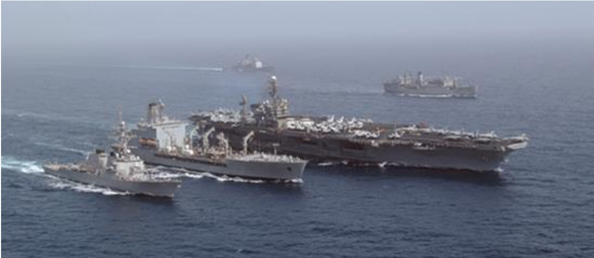
Figure 3. Fleet Oiler Conducting an UNREP

The Navy states that the photo is dated June 19, 2002, and shows the oiler Walter S. Diehl (TAO-193), at center, conducting simultaneous UNREPs with the aircraft carrier John F. Kennedy (CV-67) and the Aegis destroyer Hopper (DDG-70). CV-67, a conventionally powered carrier, has since retired from the Navy, and all of the Navy's aircraft carriers today are nuclear powered. Even so, Navy oilers continue to conduct UNREPs with Navy aircraft carriers to provide fuel for the carriers' embarked air wings.