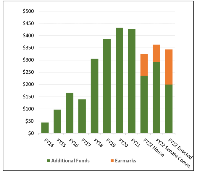
Source: CRS based on FY2014-FY2022 enacted appropriations and FY2022 Appropriations Committee data.