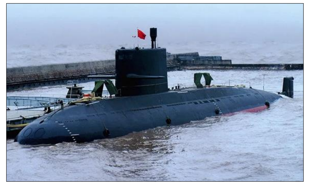
Figure 7.Yuan (Type 039) Attack Submarine (SS)

new class of SS, smaller than the Yuan design, was reported, but it is not clear whether this design is intended for China's navy, for export to other countries, or both.<sup>46</sup>