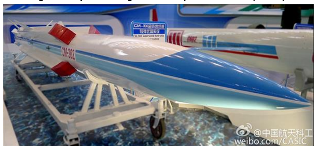
Figure 3. Reported Image of Anti-Ship Cruise Missile (ASCM)

Source: Detail of photograph accompanying Pierre Delrieu, "China Promotes Export of CM-302 Supersonic ASCM," Asian Military Review , July 3, 2017. (The article states "This is an article published in our December 2016 Issue.") The article states "According to Chinese news media reports, the China Aerospace Science and Industry Corporation (CASIC) CM-302 missile is being marketed for export as "the world's best anti-ship missile." The missile was showcased at the Zhuhai air show in the southern People's Republic of China (PRC) in early November [2016], and is advertised as [a] supersonic Anti-Ship Missile (AShM) [ASCM] which can also be used in the land attack role. The report, published by the national newspaper China Daily , suggest[s] that the CM-302 is the export version of CASIC's YJ-12 supersonic AShM, which is in service with the PRC's armed forces.")