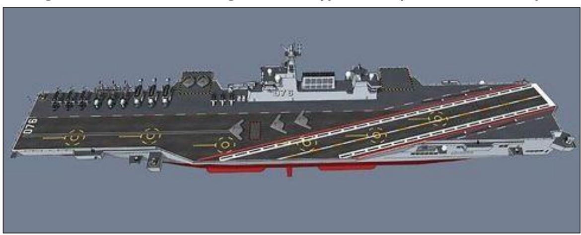
Figure 24. Notional Rendering of Possible Type 076 Amphibious Assault Ship