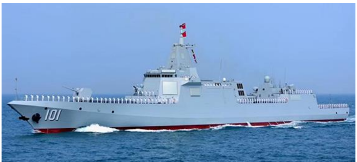
Figure 14. Renhai (Type 055) Cruiser (or Large Destroyer)

China is building a new class of cruiser (or large destroyer), called the Renhai-class or Type 055 ( Figure 14 and Figure 15 ), that reportedly displaces between 12,000 and 13,000 tons.<sup>73</sup> A March 7, 2021, press report by a Chinese media outlet states that the ship displaces more than 12,000 tons.<sup>74</sup> By way of comparison, the U.S. Navy's Ticonderoga (CG-47) class cruisers and Arleigh Burke (DDG-51) class destroyers (aka the U.S. Navy's Aegis cruisers and destroyers) displace about 10,100 tons and 9,700 tons, respectively, while the U.S. Navy's three Zumwalt (DDG-1000) class destroyers displace about 15,700 tons.