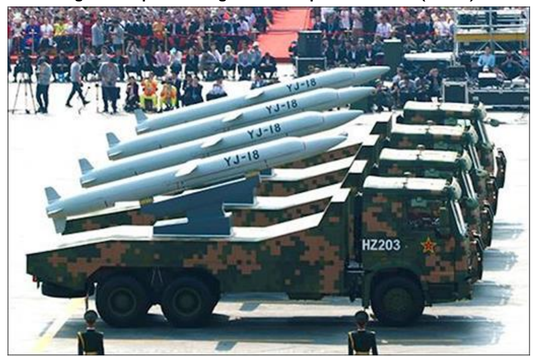
Figure 4. Reported Image of Anti-Ship Cruise Missile (ASCM)

Source: Detail of photograph accompanying Pierre Delrieu, "China Promotes Export of CM-302 Supersonic ASCM," Asian Military Review , July 3, 2017. (The article states "This is an article published in our December 2016 Issue.") The article states "According to Chinese news media reports, the China Aerospace Science and Industry Corporation (CASIC) CM-302 missile is being marketed for export as "the world's best anti-ship missile." The missile was showcased at the Zhuhai air show in the southern People's Republic of China (PRC) in early November [2016], and is advertised as [a] supersonic Anti-Ship Missile (AShM) [ASCM] which can also be used in the land attack role. The report, published by the national newspaper China Daily , suggest[s] that the CM-302 is the export version of CASIC's YJ-12 supersonic AShM, which is in service with the PRC's armed forces.")