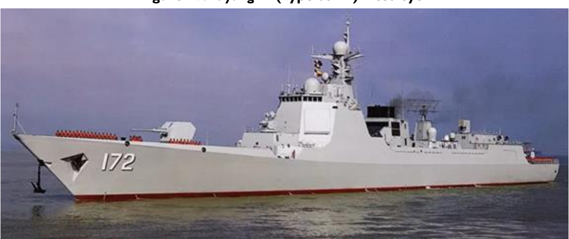
Figure 17. Luyang III (Type 052D) Destroyer