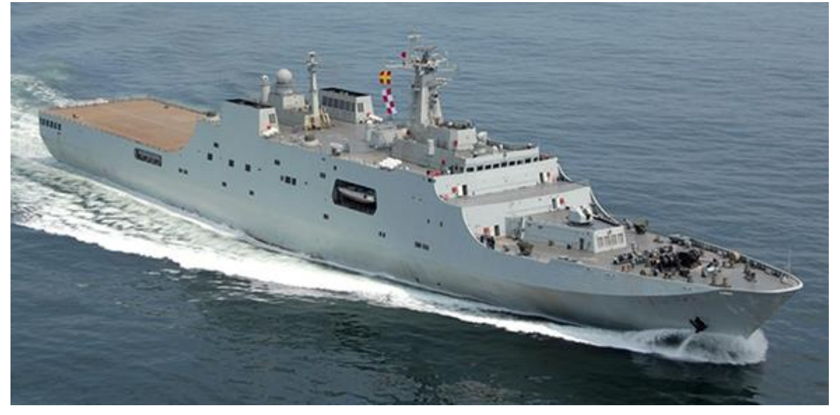
Figure 20. Yuzhao (Type 071) Amphibious Ship

(LPD-17) class amphibious ships. A May 6, 2021, press report states that the eighth Type 0721 ship "recently made its first publicly known maritime exercise appearance."<sup>95</sup>