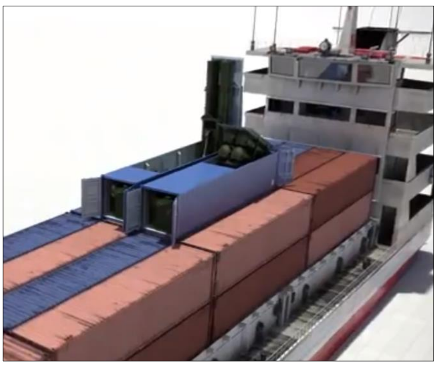
Figure 6. Illustration of Reported Potential Containerized ASCM Launcher