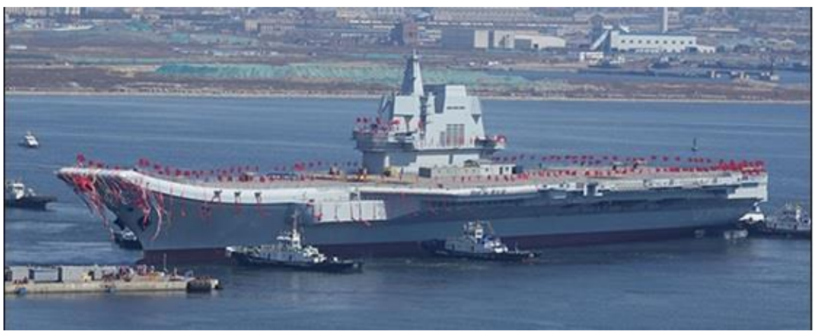
Figure 11. Shandong (Type 002) Aircraft Carrier