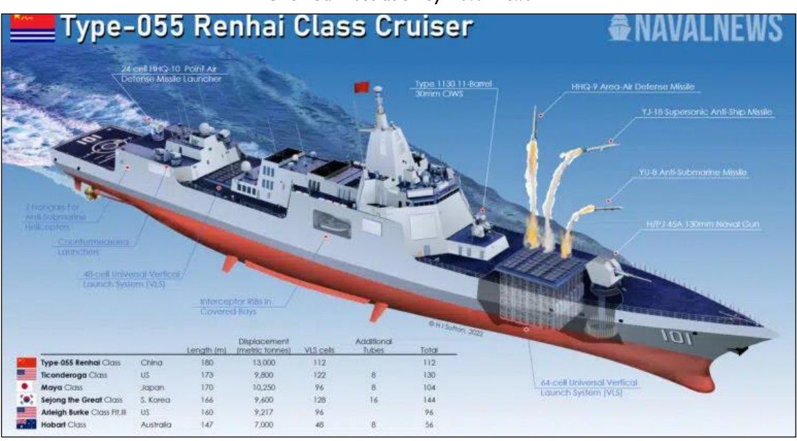
Figure 16. Renhai (Type 055) Cruiser (or Large Destroyer)