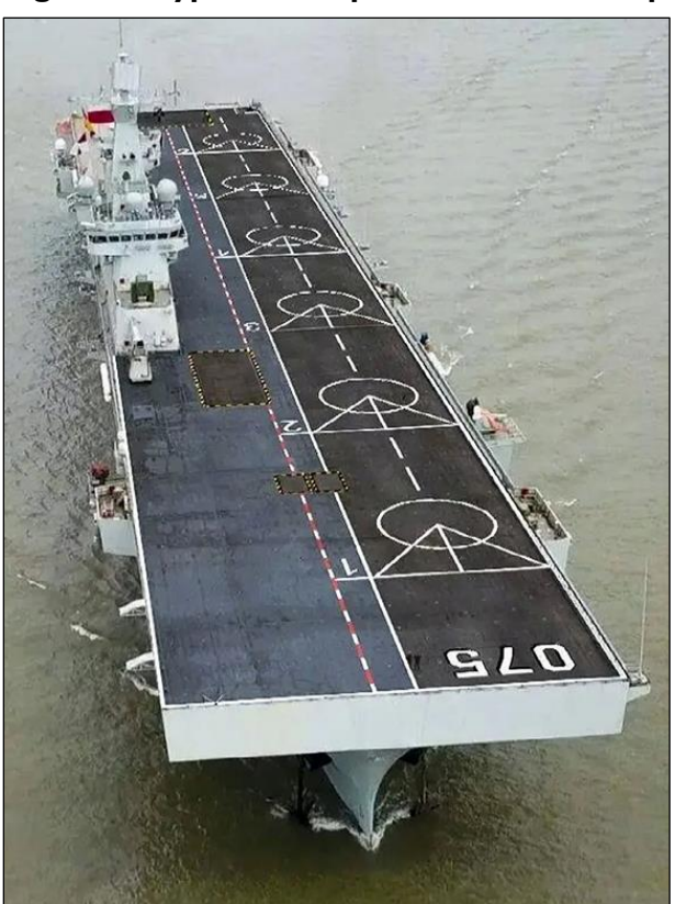
Figure 22. Type 075 Amphibious Assault Ship

Possible Type 076 Catapult-Equipped Amphibious Assault Ship.