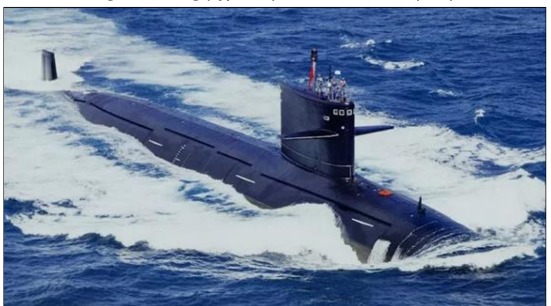
Source: Photograph accompanying "Type 039A Yuan class," SinoDefence.com, July 10, 2018, accessed August 28, 2019.