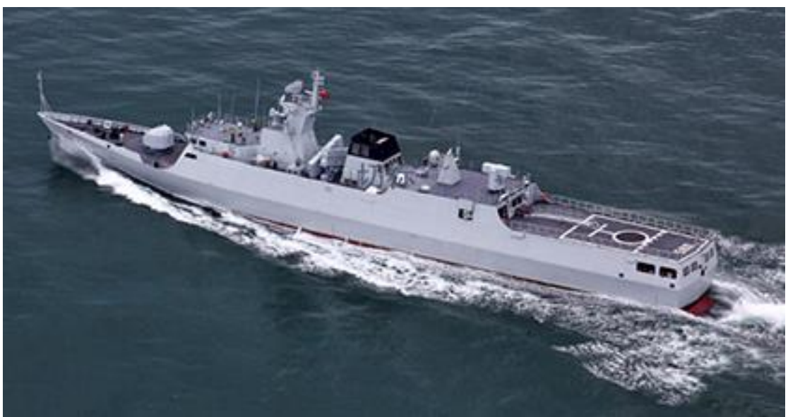
Figure 19. Jingdao (Type 056) Corvette

that 20 to 22 of the ships were being transferred to China's coast guard and modified for coast guard operations,<sup>92</sup> which would leave 50 to 52 in China's navy. Table 1 shows a total of 51 Type 056 ships in China's navy as of 2021. As shown in Table 1 , the rapid growth in the number of Type 056 corvettes since 2013 accounts for a substantial share of the net increase in the total number of ships in China's navy since 2013.