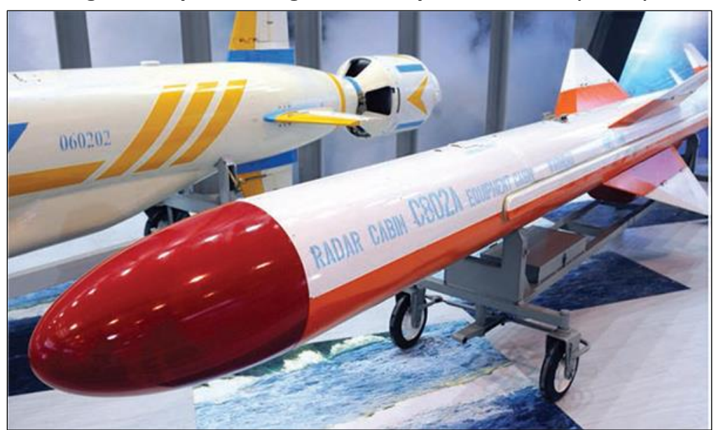
Figure 5. Reported Image of Anti-Ship Cruise Missile (ASCM)