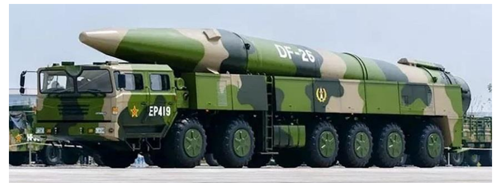
Figure 2. DF-26 Multi-Role Intermediate-Range Ballistic Missile (IRBM)