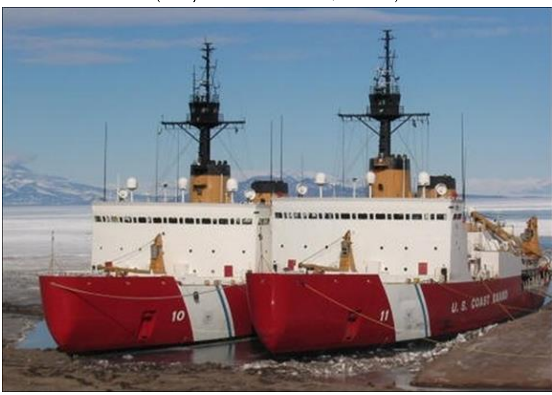
Figure A-I. Polar Star and Polar Sea (Side by side in McMurdo Sound, Antarctica)

Polar Star (WAGB-10) and Polar Sea (WAGB-11),<sup>56</sup> sister ships built to the same general design ( Figure A-1 and Figure A-2 ), were acquired in the early 1970s as replacements for earlier U.S. icebreakers. They were designed for 30-year service lives, and were built by Lockheed Shipbuilding of Seattle, WA, a division of Lockheed that also built ships for the U.S. Navy, but which exited the shipbuilding business in the late 1980s.