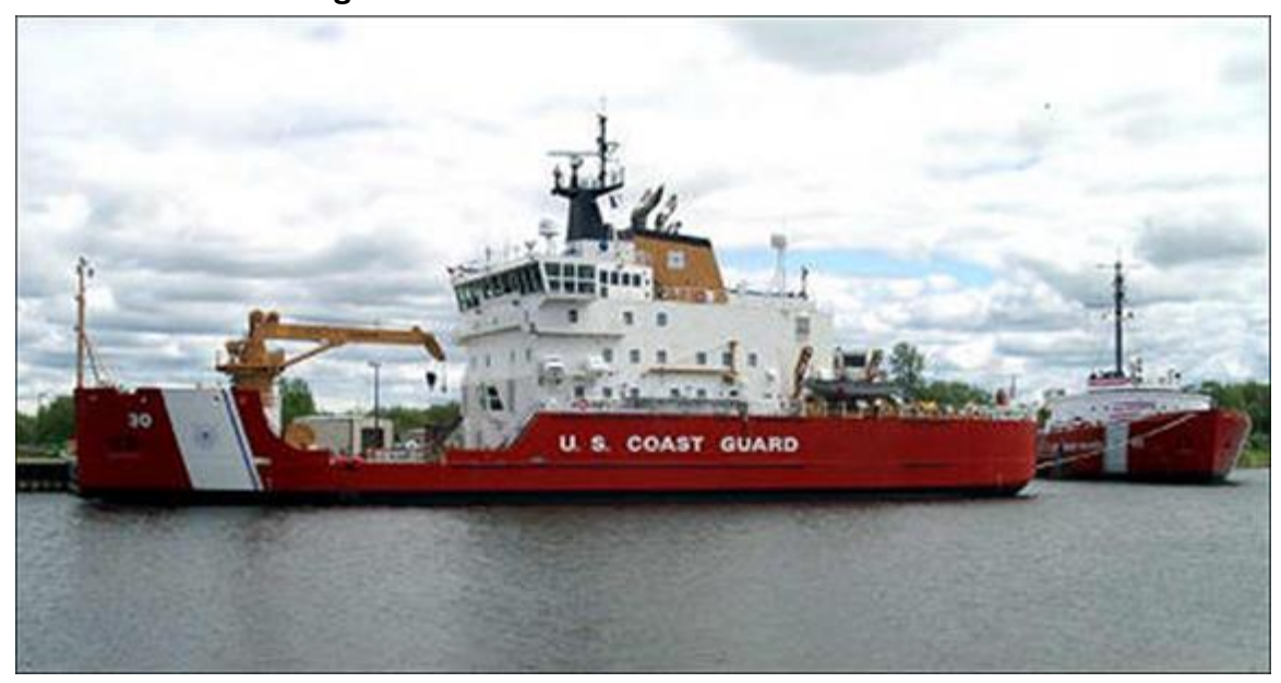
Figure C-1. Great Lakes Icebreaker Mackinaw