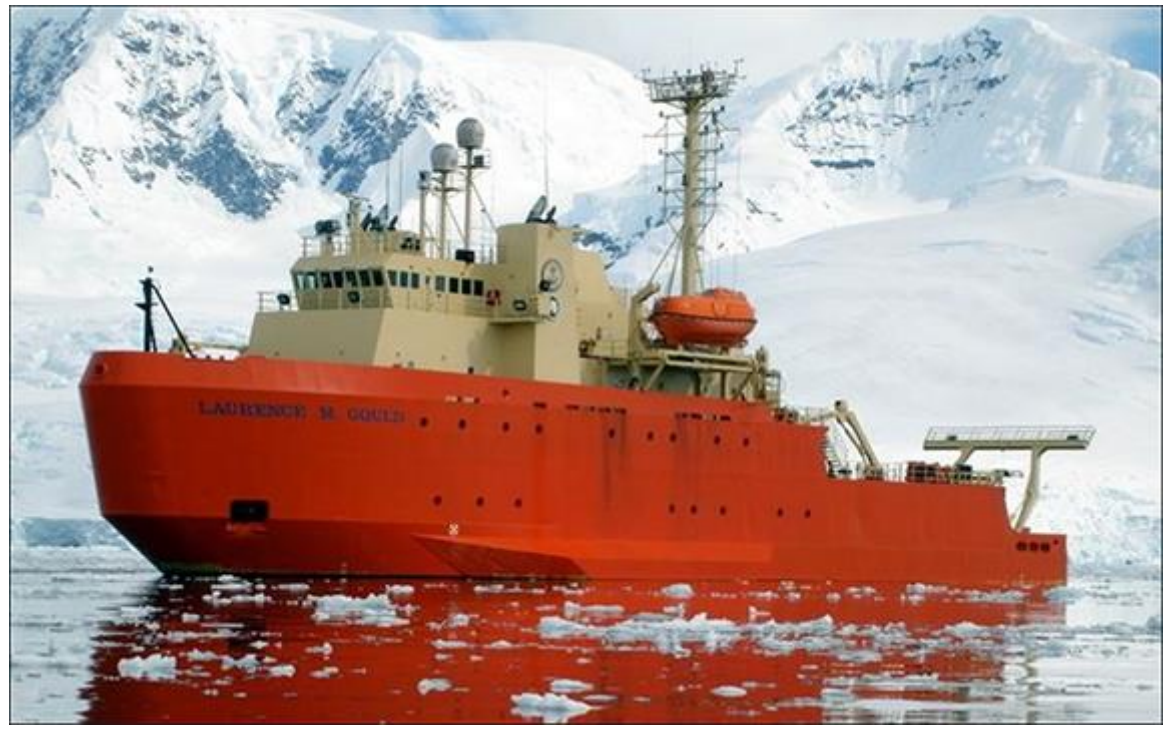
Figure A-5. Laurence M. Gould

Like Palmer , the polar research and supply ship Laurence M. Gould ( Figure A-5 ) was built for NSF by North American Shipping. It was completed in 1997 and is operated for NSF on a long-term charter from ECO. It is 230 feet long and has a displacement of about 3,800 tons. It has a crew of 16 and can embark a scientific staff of 26 to 28 (with a capacity for 9 more in a berthing van). It can break ice up to 1 foot thick with continuous forward motion. Like Palmer , it was built to support NSF operations in the Antarctic, particularly operations at Palmer Station on the Antarctic Peninsula.