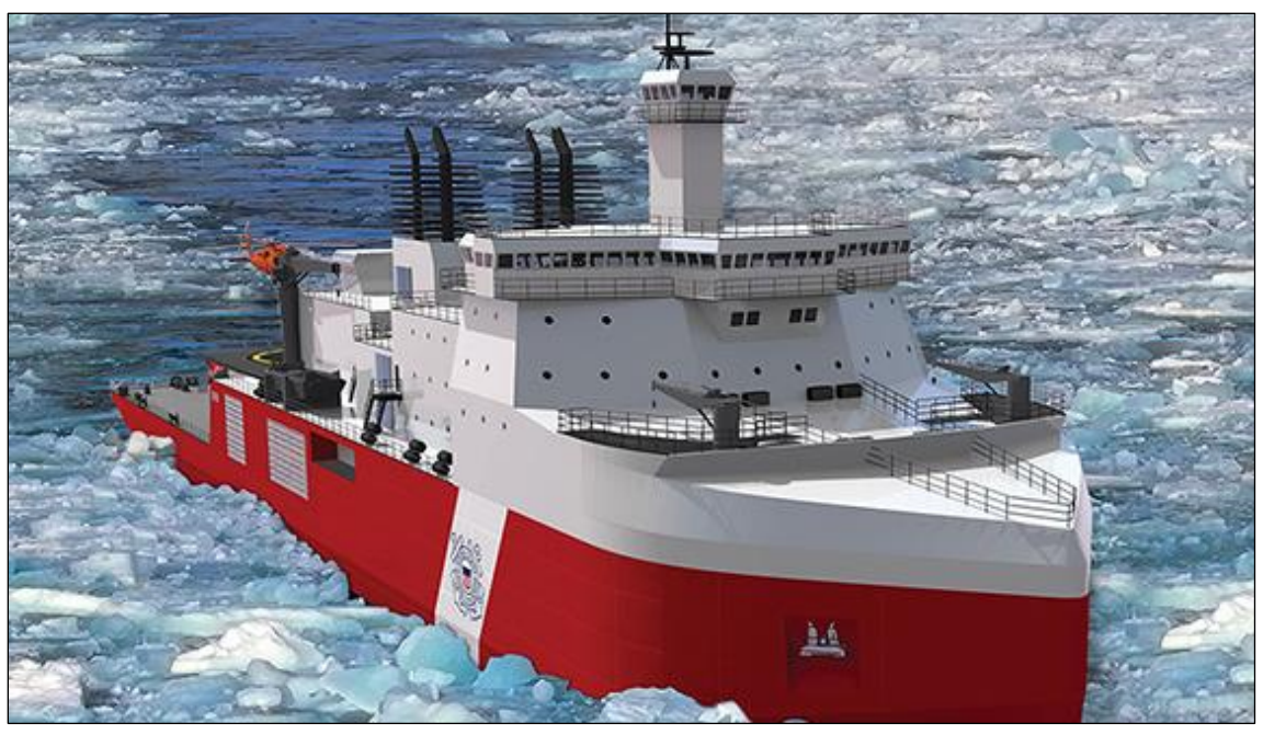
Figure 4. Rendering of Halter Marine Design for PSC