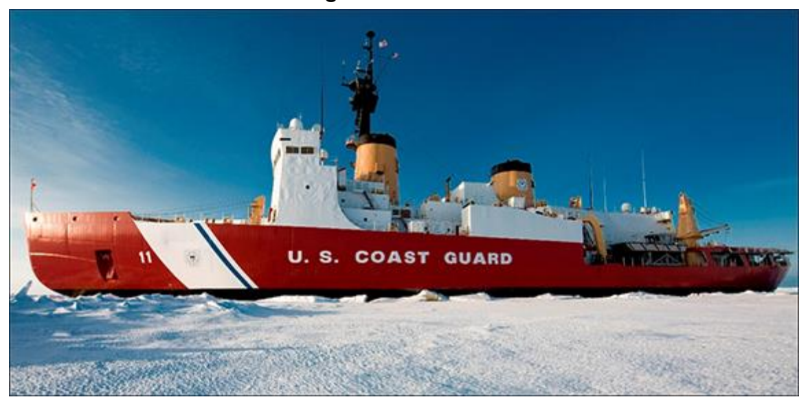
Figure A-2. Polar Sea