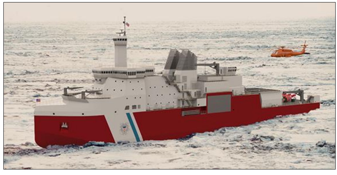
Figure 3. Rendering of Halter Marine Design for PSC