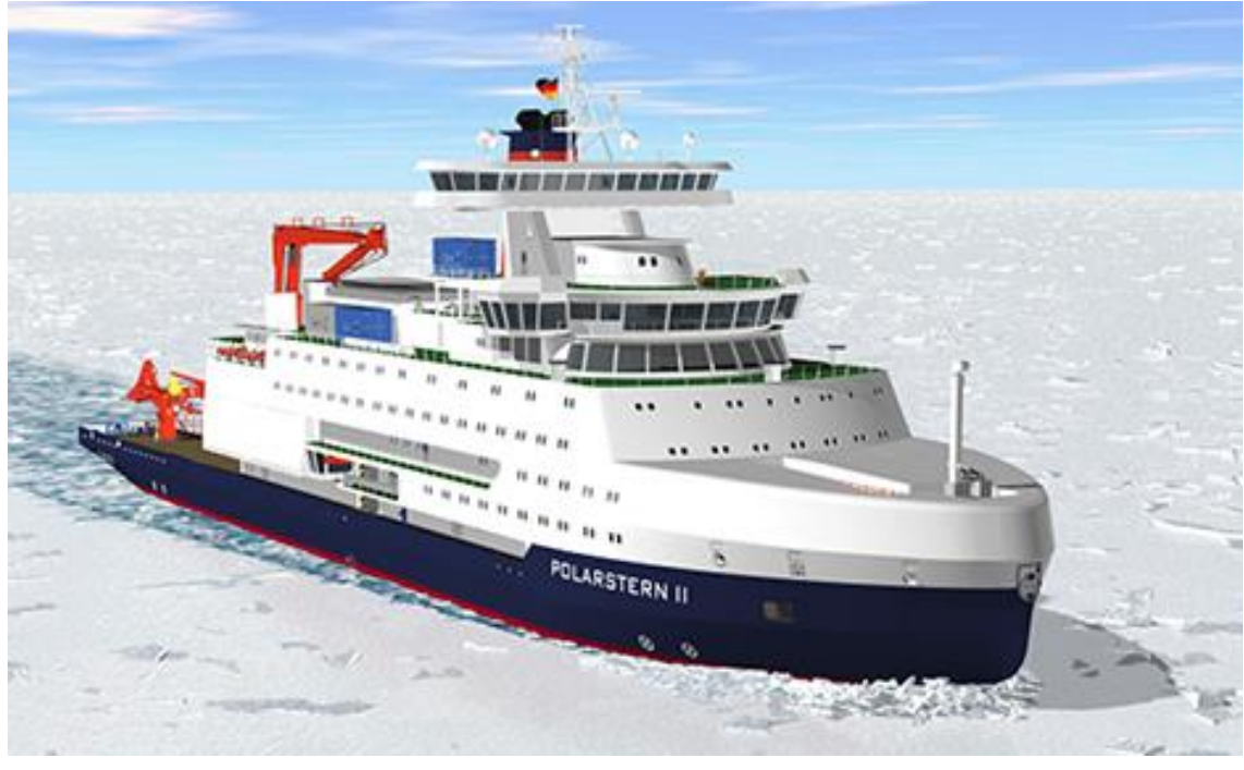
Figure 5. Rendering of SDC Concept Design for Polarstern II