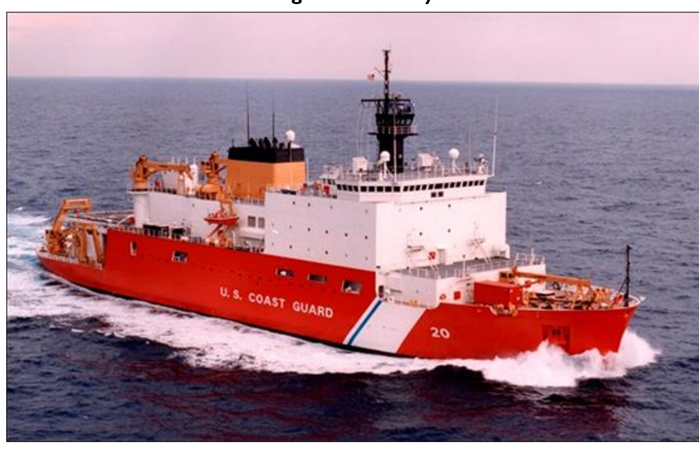
Figure A-3. Healy

Healy (WAGB-20) ( Figure A-3 ) was funded in the early 1990s as a complement to Polar Star and Polar Sea , and was commissioned into service on August 21, 2000.