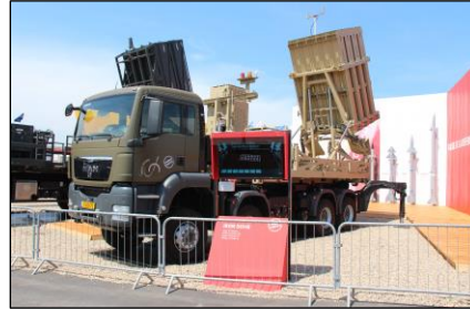
Figure 6. Iron Dome Launcher

To date, the United States has provided $1.7 billion to Israel for Iron Dome batteries, interceptors, co-production costs, and general maintenance (see Table 5). Because Iron Dome was developed by Israel alone, Israel initially retained proprietary technology rights to it. The United States and Israel have had a decades-long partnership in the development and co-production of other missile defense systems (such as the Arrow). As the United States began financially supporting Israel's development of Iron Dome in FY2011, U.S. interest in ultimately becoming a partner in its co-production grew. Congress then called for Iron Dome technology sharing and co-production with the United States. 110