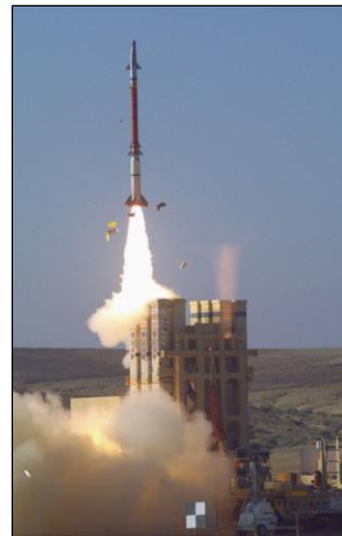
Figure 7. David's Sling Launches Stunner Interceptor

Israel first used David's Sling in July 2018. At the time, Syrian regime forces were attempting to retake parts of southern Syria as part of the ongoing conflict there. During the fighting, Assad loyalists fired two SS-21 Tochka or ‘Scarab’ tactical ballistic missiles at rebel forces, but the missiles veered into Israeli territory. David's Sling fired two Stunner interceptors, but the final impact point of the Syrian missiles changed mid-flight, and Israel ordered one of the interceptors to self-destruct; the other most likely landed in Syrian territory. 132 Chinese media claimed that Assad regime forces recovered the Stunner interceptor intact and handed it over to Russia; the Israeli government did not comment on this allegation. 133