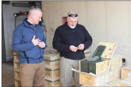
Figure 8. Army Officers Inspect WRSA-I