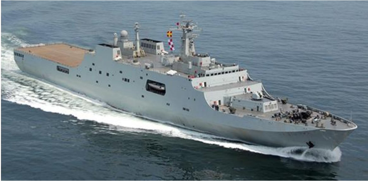
Figure 20. Yuzhao (Type 071) Amphibious Ship