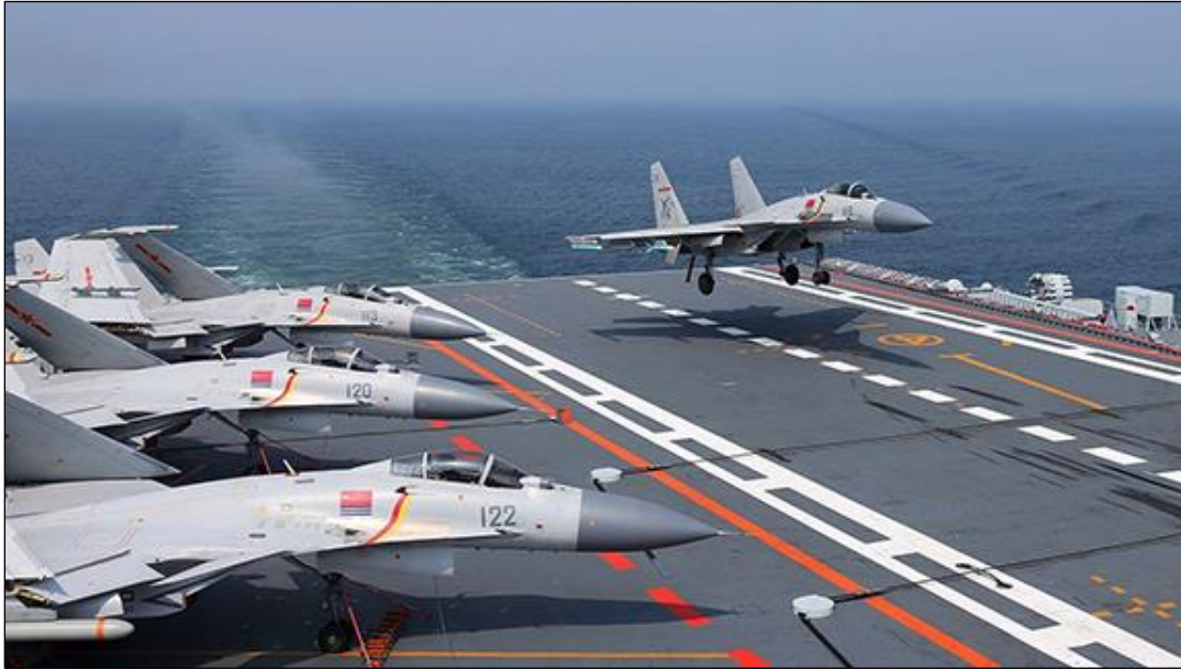
Figure 13. J-15 Flying Shark Carrier-Capable Fighter