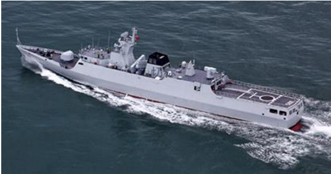
Figure 19. Jingdao (Type 056) Corvette