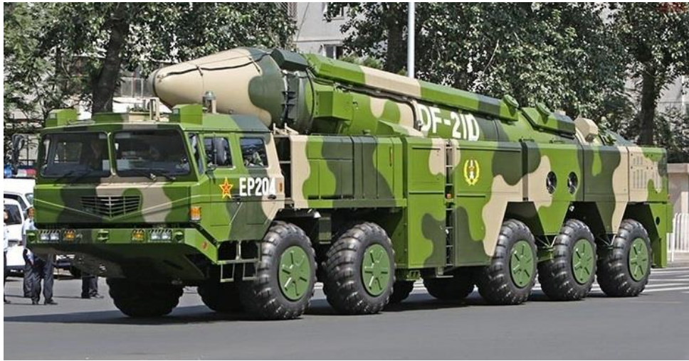
Figure 1. DF-21D Anti-Ship Ballistic Missile (ASBM)