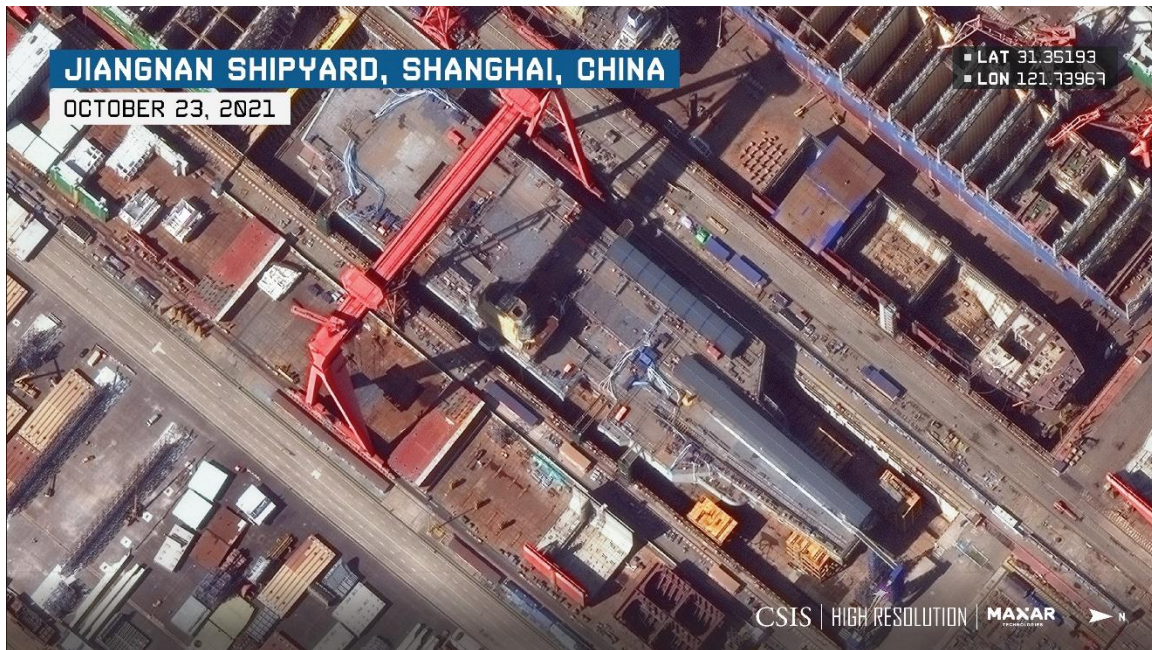
Figure 12. Type 003 Aircraft Carrier Under Construction