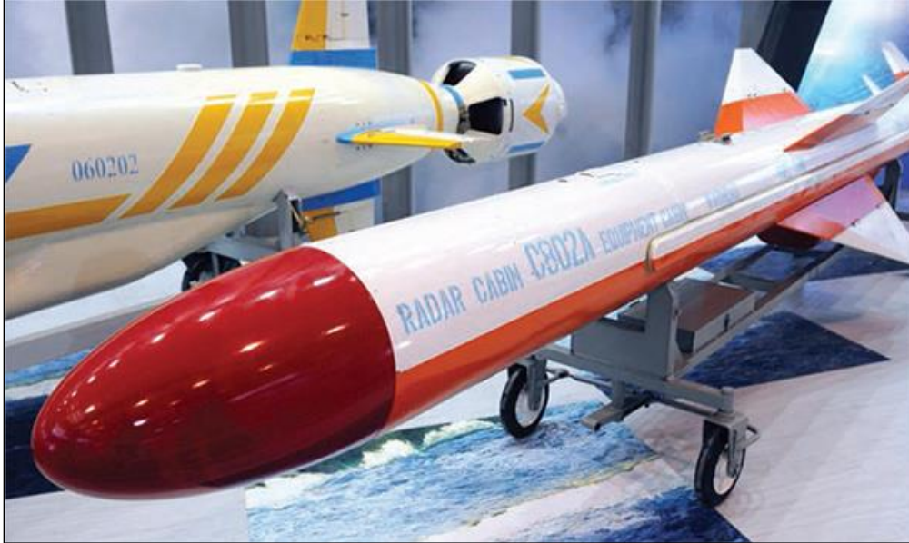
Figure 5. Reported Image of Anti-Ship Cruise Missile (ASCM)