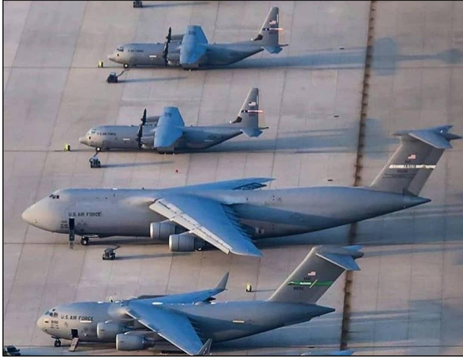
Figure 2. C-130, C-5 and C-17 Comparison