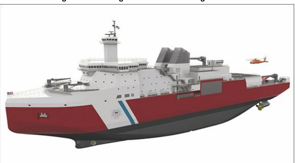
Figure 1. Rendering of Halter Marine Design for PSC

Source: Illustration accompanying Sam LaGrone, "UPDATED: VT Halter Marine to Build New Coast Guard Icebreaker," USNI News, April 23, 2019, updated April 24, 2019. The caption to the illustration states "An artist's rendering of VT Halter Marine's winning bid for the U.S. Coast Guard Polar Security Cutter. VT Halter Marine image used with permission."