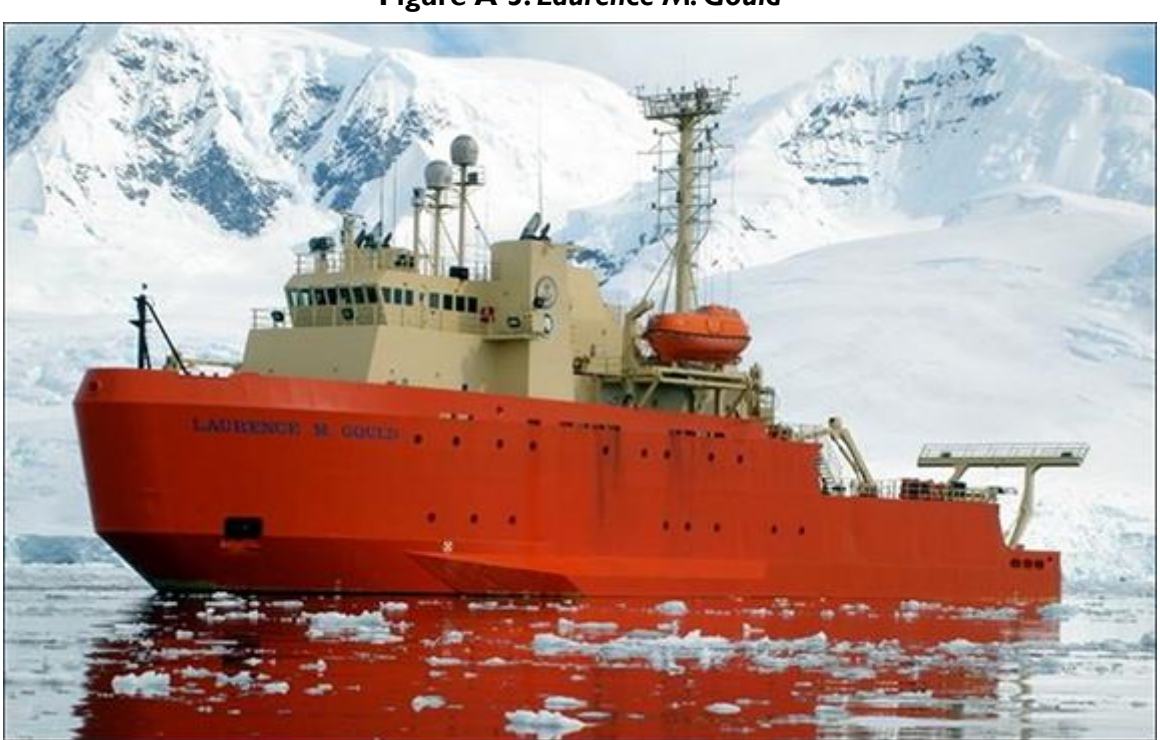
Figure A-5. Laurence M. Gould

Like Palmer , the polar research and supply ship Laurence M. Gould (Figure A-5) was built for NSF by North American Shipping. It was completed in 1997 and is operated for NSF on a long-term charter from ECO. It is 230 feet long and has a displacement of about 3,800 tons. It has a crew of 16 and can embark a scientific staff of 26 to 28 (with a capacity for 9 more in a berthing van). It can break ice up to 1 foot thick with continuous forward motion. Like Palmer , it was built to support NSF operations in the Antarctic, particularly operations at Palmer Station on the Antarctic Peninsula.