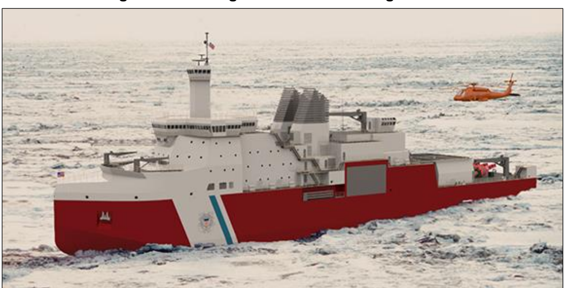
Figure 3. Rendering of Halter Marine Design for PSC

Source: Technology Associates, Inc. (cropped version of rendering posted at http://www.navalarchitects.us/ pictures.html, accessed June 10, 2020). A similar image was included in Halter Marine press release, "VT Halter Marine Awarded the USCG Polar Security Cutter," May 7, 2019, accessed May 8, 2019, at http://www.vthm.com/ public/files/20190507.pdf.