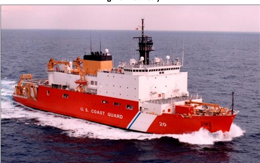
Figure A-3. Healy

Healy (WAGB-20) (Figure A-3) was funded in the early 1990s as a complement to Polar Star and Polar Sea , and was commissioned into service on August 21, 2000.