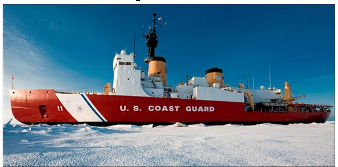
Figure A-2. Polar Sea

Source: Coast Guard photograph that was accessed April 21, 2011, at http://www.uscg.mil/pacarea/cgcpolarsea/ img/PSEApics/FullShip2.jpg (link no longer active). The photograph accompanies Associated Press, "Reprieve for Seattle-Based Icebreaker Polar Sea," KOMO News, June 15, 2012, posted at https://komonews.com/news/local/ reprieve-for-seattle-based-icebreaker-polar-sea.