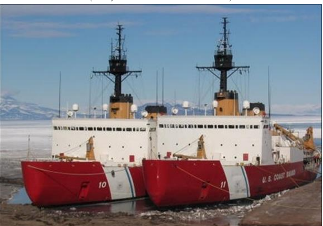
Figure A-I. Polar Star and Polar Sea

(Side by side in McMurdo Sound, Antarctica)