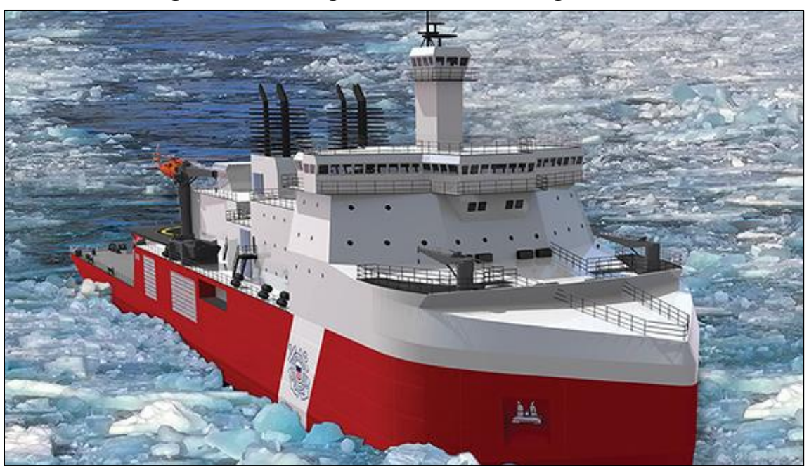
Figure 4. Rendering of Halter Marine Design for PSC

A similar image was included in Halter Marine press release, "VT Halter Marine Awarded the USCG Polar Security Cutter," May 7, 2019, accessed May 8, 2019, at http://www.vthm.com/ public/files/20190507.pdf.