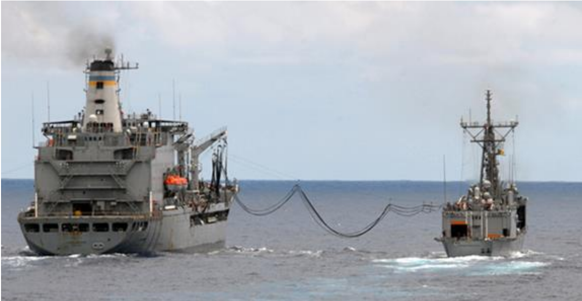
Figure 2. Fleet Oiler Conducting an UNREP

Source: Cropped version of Navy photo accessed May 5, 2014, at http://www.navy.mil/view_image.asp?id=61415 . The Navy states that the photo is dated July 13, 2008, and shows the oiler Leroy Grumman (TAO-195) refueling the frigate Underwood (FFG-36) during an exercise with the Iwo Jima (LHD-7) Expeditionary Strike Group in the Atlantic Ocean.