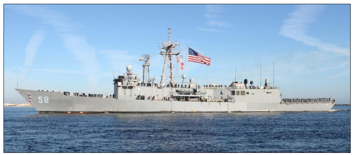
Figure I. Oliver Hazard Perry (FFG-7) Class Frigate

The most recent class of frigates operated by the Navy was the Oliver Hazard Perry (FFG-7) class ( Figure 1 ). A total of 51 FFG-7s were procured between FY1973 and FY1984. The ships entered service between 1977 and 1989, and were decommissioned between 1994 and 2015. In their final configuration, FFG-7s were about 455 feet long and had full load displacements of roughly 3,900 tons to 4,100 tons. (By comparison, the Navy's Arleigh Burke [DDG-51] class destroyers are about 510 feet long and have full load displacements of roughly 9,700 tons.<sup>9</sup>) Following their decommissioning, a number of FFG-7s, like certain other decommissioned U.S. Navy ships, have been transferred to the navies of U.S. allied and partner countries.