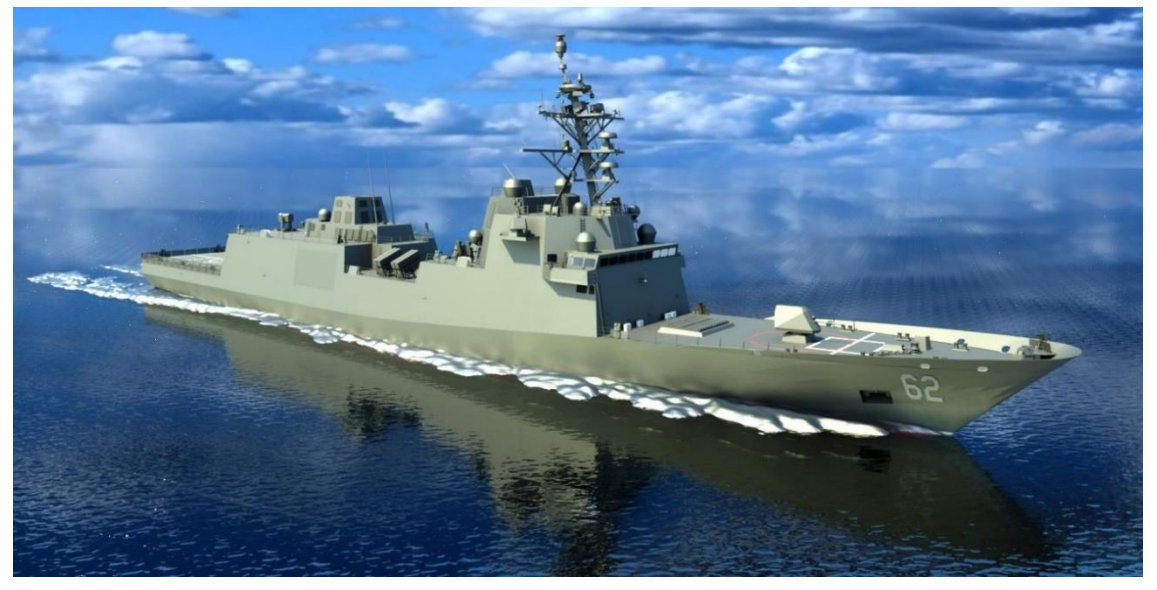
Figure 2. Constellation (FFG-62) Class Frigate Artist's rendering of F/MM design

incorporated [into Fincantieri's proposed design for the FFG-62] prior to [the Navy's] contract award [for the FFG-62 program to Fincantieri]."<sup>13</sup>