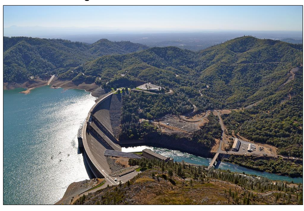
Figure 2. Shasta Dam and Reservoir