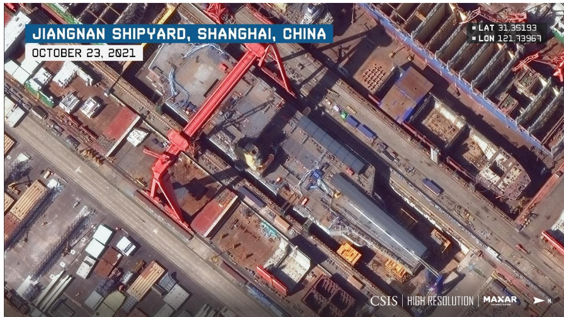
Figure 11. Type 003 Aircraft Carrier Under Construction