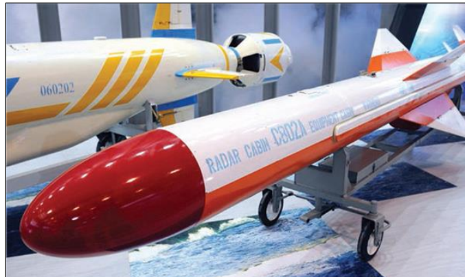
Figure 5. Reported Image of Anti-Ship Cruise Missile (ASCM)