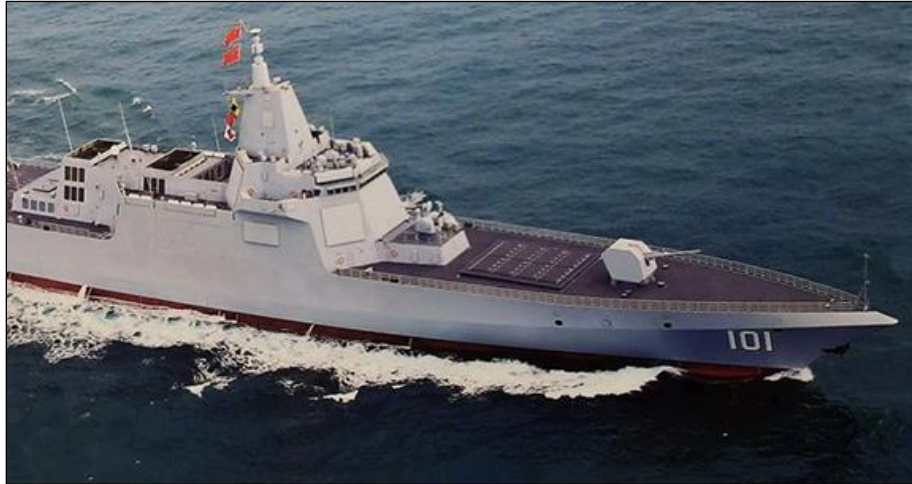
Figure 14. Renhai (Type 055) Cruiser (or Large Destroyer)