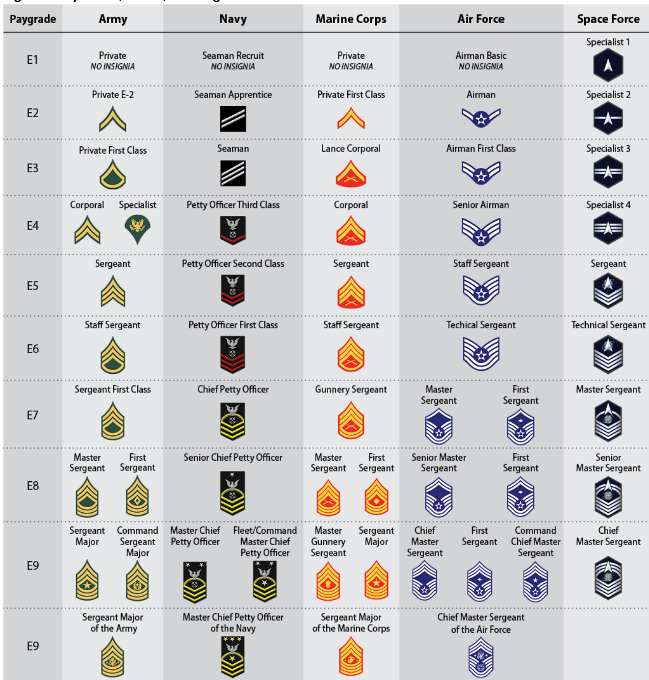
Figure 1. Pay Grade, Grade, and Insignia of Enlisted Service Members