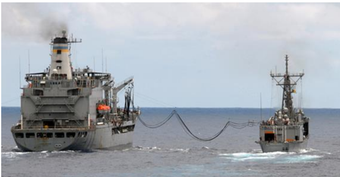
Figure 2. Fleet Oiler Conducting an UNREP

Source: Cropped version of Navy photo accessed May 5, 2014, at http://www.navy.mil/view_image.asp?id=61415 . The Navy states that the photo is dated July 13, 2008, and shows the oiler Leroy Grumman (TAO-195) refueling the frigate Underwood (FFG-36) during an exercise with the Iwo Jima (LHD-7) Expeditionary Strike Group in the Atlantic Ocean.