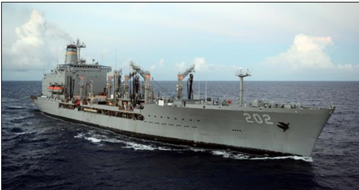
Figure 4. Kaiser (TAO-I 87) Class Fleet Oiler

(The oilers shown in Figure 1 , Figure 2 , and Figure 3 are also Kaiser-class class oilers.)