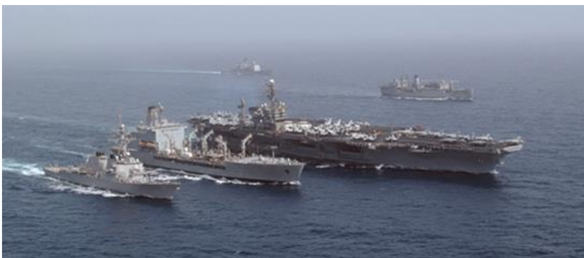
Figure 3. Fleet Oiler Conducting an UNREP

The Navy states that the photo is dated June 19, 2002, and shows the oiler Walter S. Diehl (TAO-193), at center, conducting simultaneous UNREPs with the aircraft carrier John F. Kennedy (CV-67) and the Aegis destroyer Hopper (DDG-70). CV-67, a conventionally powered carrier, has since retired from the Navy, and all of the Navy's aircraft carriers today are nuclear powered. Even so, Navy oilers continue to conduct UNREPs with Navy aircraft carriers to provide fuel for the carriers' embarked air wings.