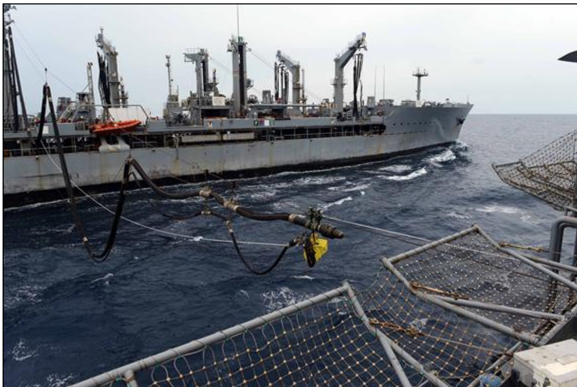
Figure 1. Fleet Oiler Conducting an UNREP

The Navy states that the photo is dated October 24, 2013, and shows the oiler Tippecanoe (TAO-199) extending its fuel probe to the Aegis cruiser USS Antietam (CG-54), a part of the George Washington (CVN-73) Carrier Strike Group, in the South China Sea.