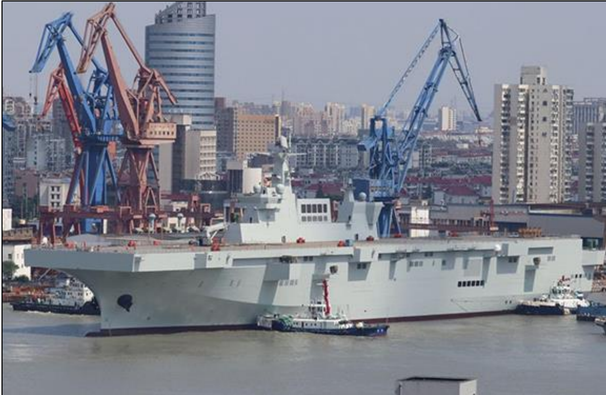
Figure 19. Type 075 Amphibious Assault Ship