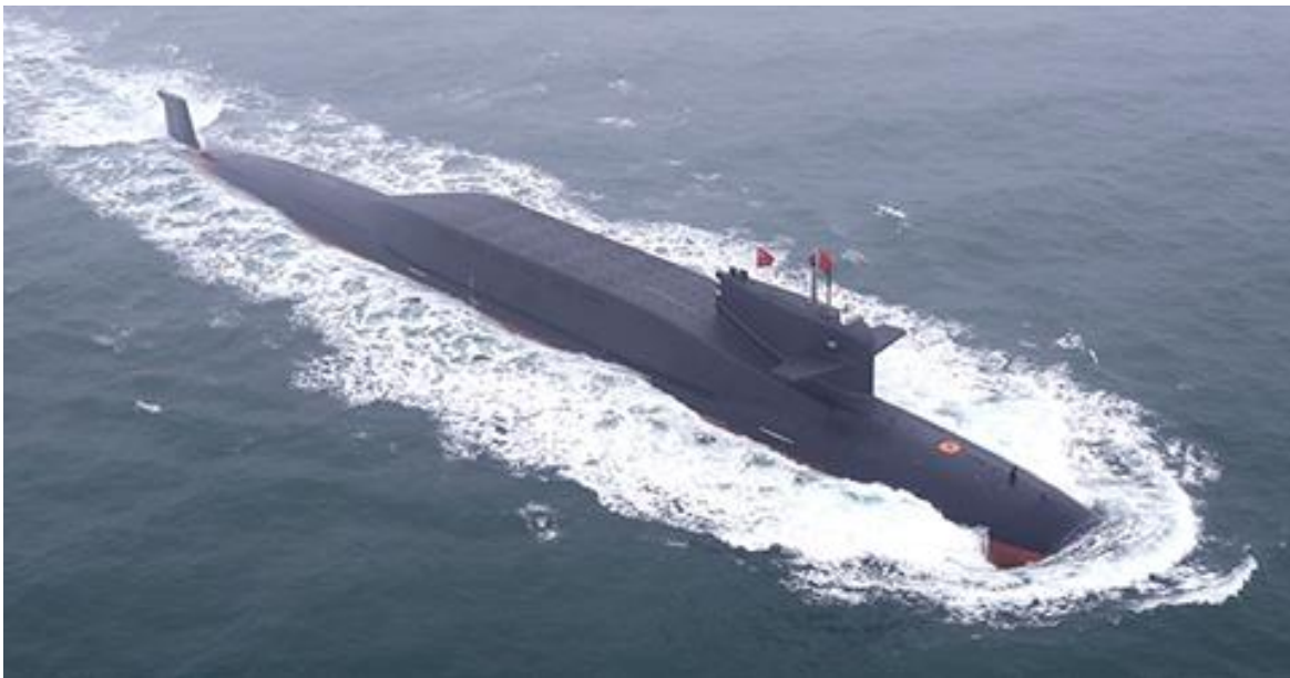
Figure 8. Jin (Type 094) Ballistic Missile Submarine (SSBN)