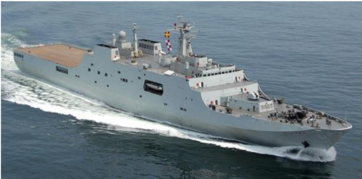
Figure 18. Yuzhao (Type 071) Amphibious Ship