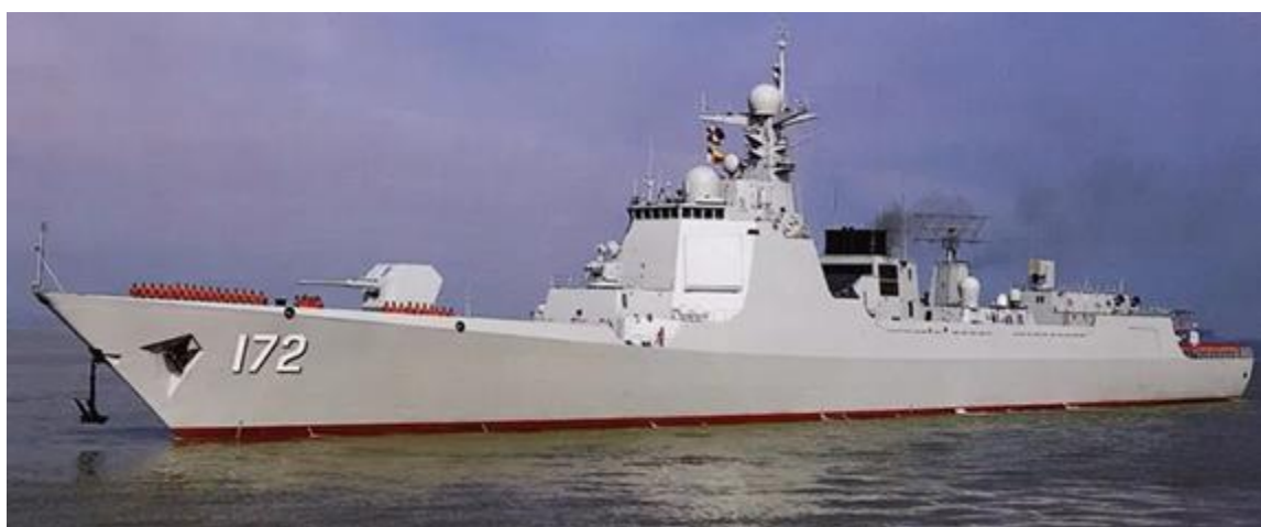
Figure 15. Luyang III (Type 052D) Destroyer