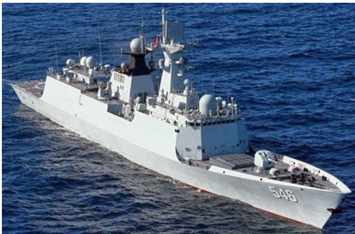
Figure 16. Jiangkai II (Type 054A) Frigate