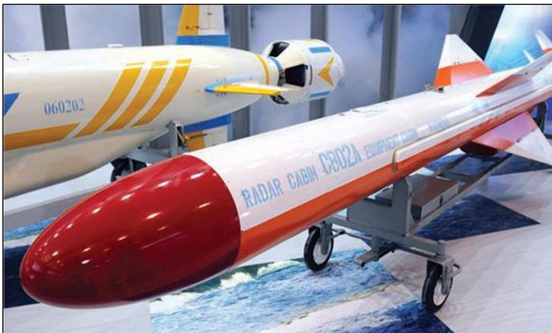
Figure 5. Reported Image of Anti-Ship Cruise Missile (ASCM)