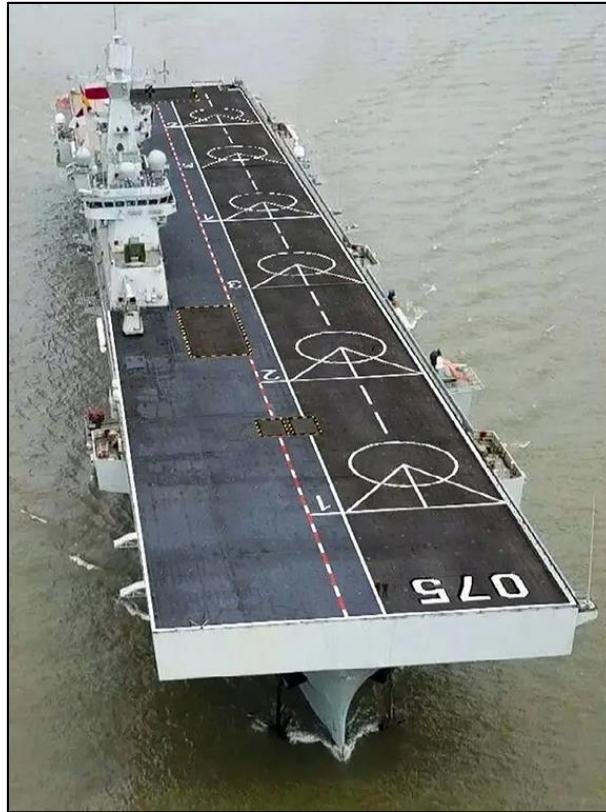
Figure 20. Type 075 Amphibious Assault Ship

Possible Type 076 Catapult-Equipped Amphibious Assault Ship