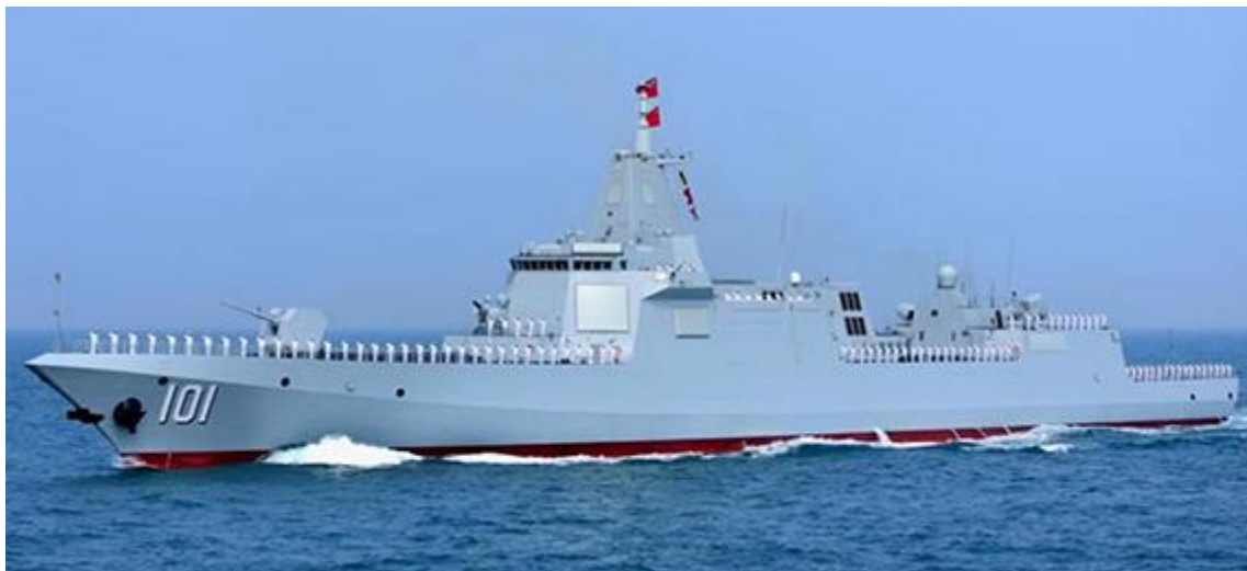
Figure 13. Renhai (Type 055) Cruiser (or Large Destroyer)