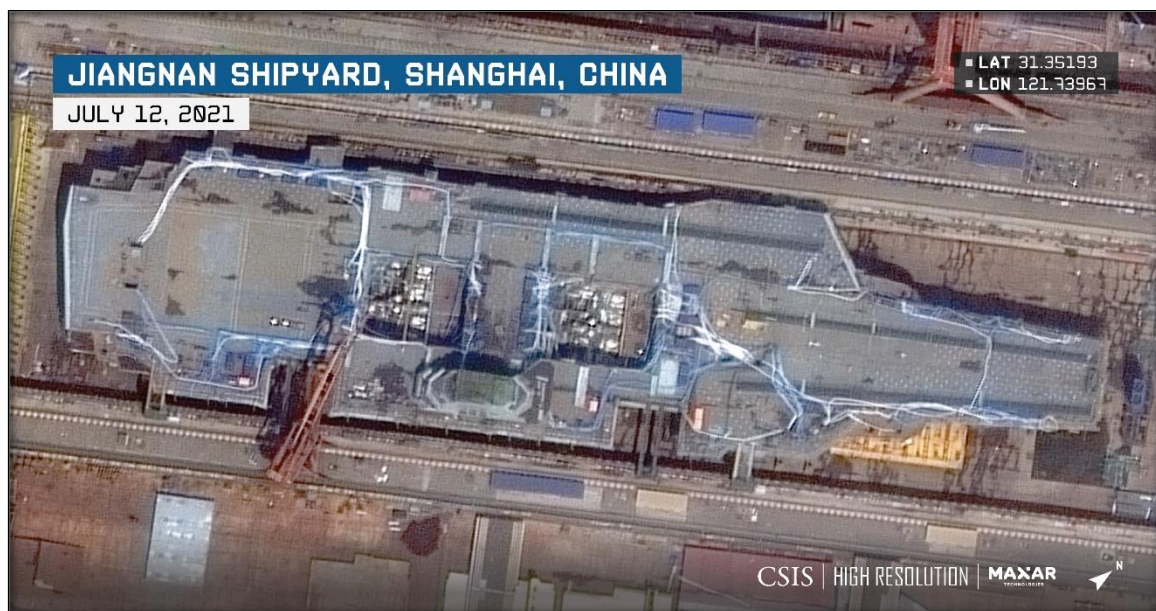
Figure 11. Type 003 Aircraft Carrier Under Construction