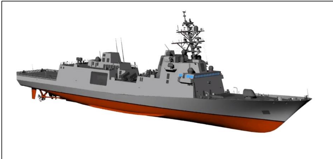
Figure 3. Constellation (FFG-62) Class Frigate Computer rendering of F/MM design