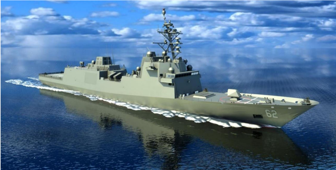
Figure 2. Constellation (FFG-62) Class Frigate Artist’s rendering of F/MM design

Source: Cropped version of illustration accompanying Fincantieri Marinette Marine, “Fincantieri Marinette Marine Awarded Second Constellation-class Frigate,” May 20, 2021.