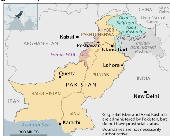
Figure 2. Map of Pakistan