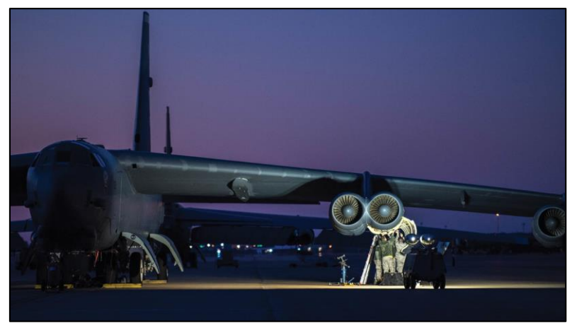
Figure 1. Engine Mounting on B-52

The Air Force currently operates 76 B-52Hs, the most recent of which was built in the 1960s. The Air Force now expects to operate them until 2050. The last TF33 engine was built in 1985. (For more on the B-52 fleet, see CRS Report R43049, U.S. Air Force Bomber Sustainment and Modernization: Background and Issues for Congress. )