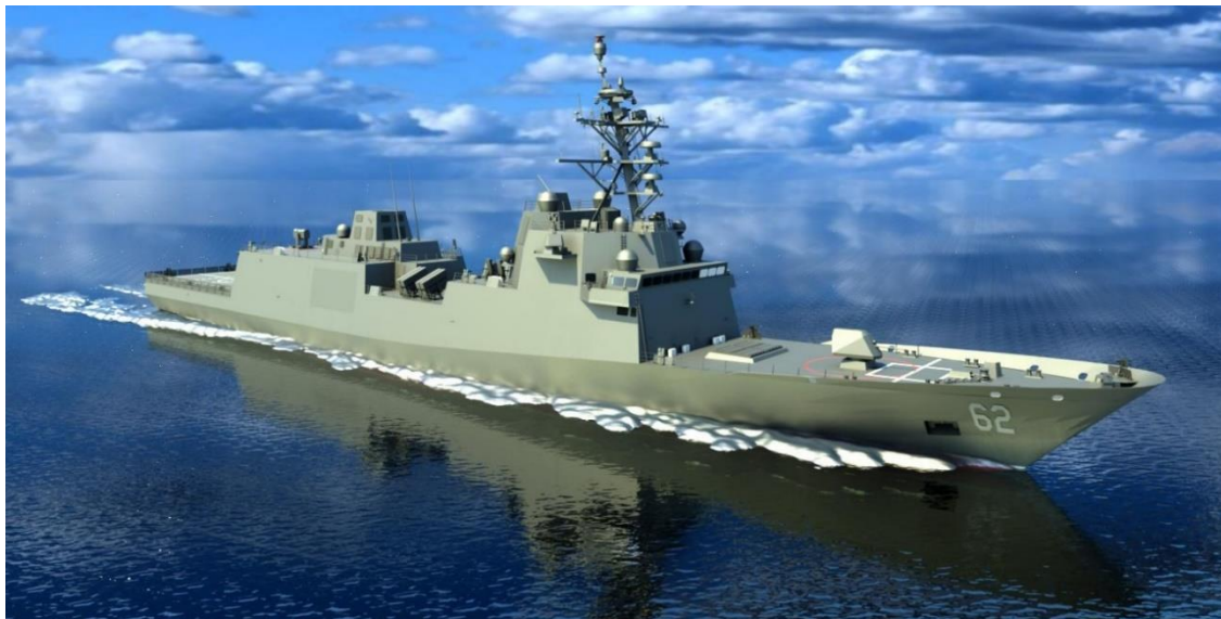
Figure 2. Constellation (FFG-62) Class Frigate Artist’s rendering of F/MM design

Source: Cropped version of illustration accompanying Fincantieri Marinette Marine, “Fincantieri Marinette Marine Awarded Second Constellation-class Frigate,” May 20, 2021.