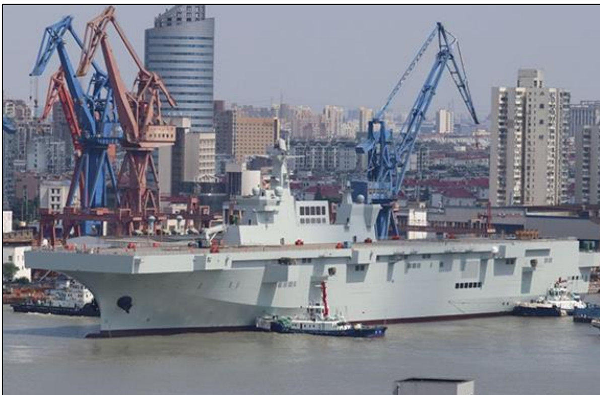
Figure 19. Type 075 Amphibious Assault Ship