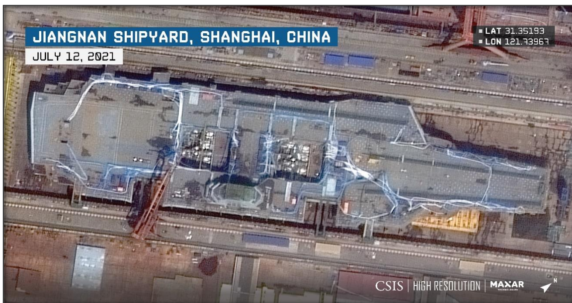
Figure 11. Type 003 Aircraft Carrier Under Construction