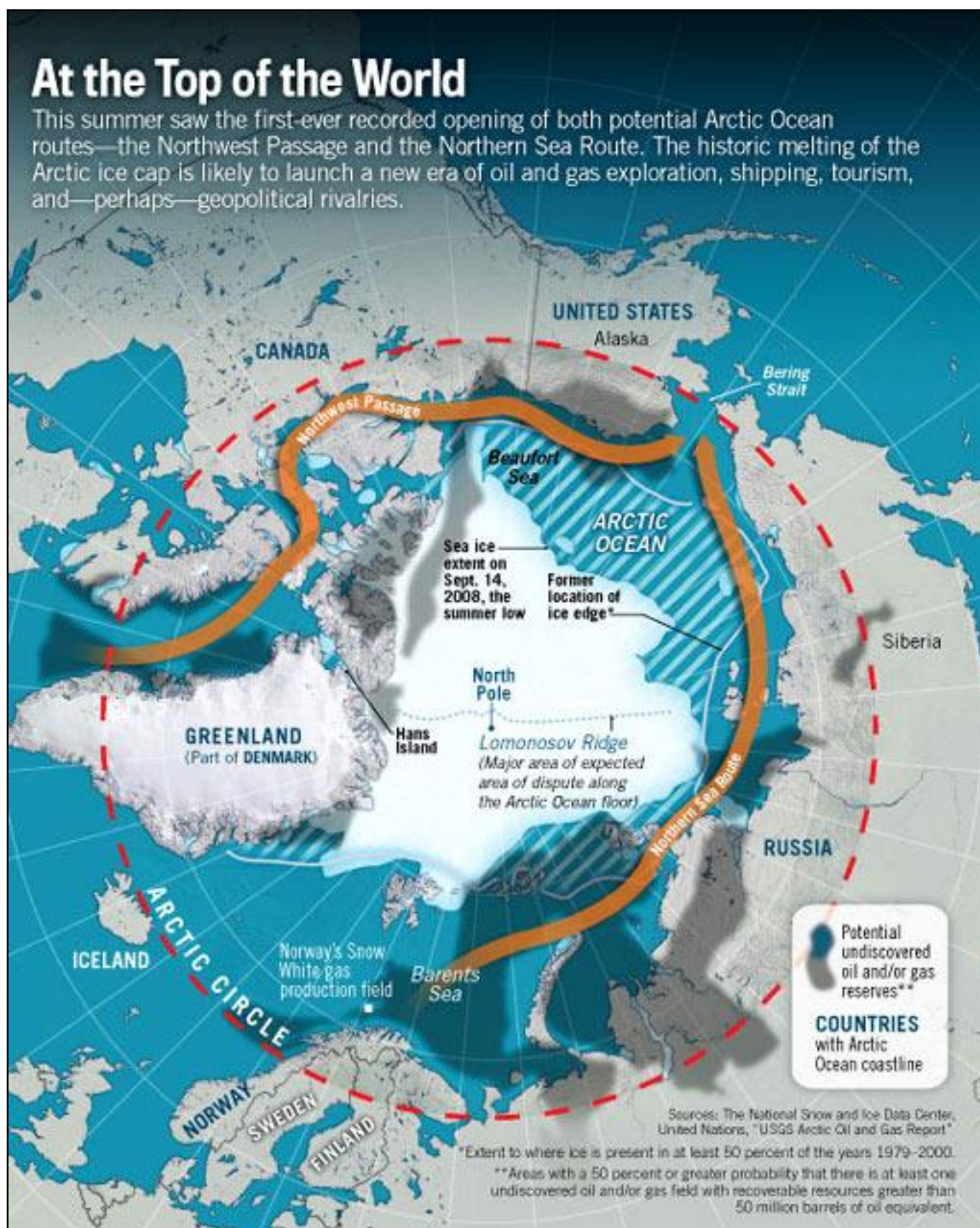
Figure 3. Arctic Sea Ice Extent in September 2008, Compared with Prospective Shipping Routes and Oil and Gas Resources