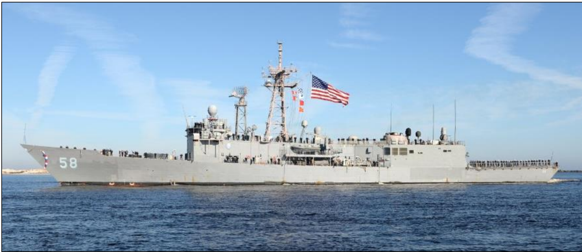
Figure 1. Oliver Hazard Perry (FFG-7) Class Frigate