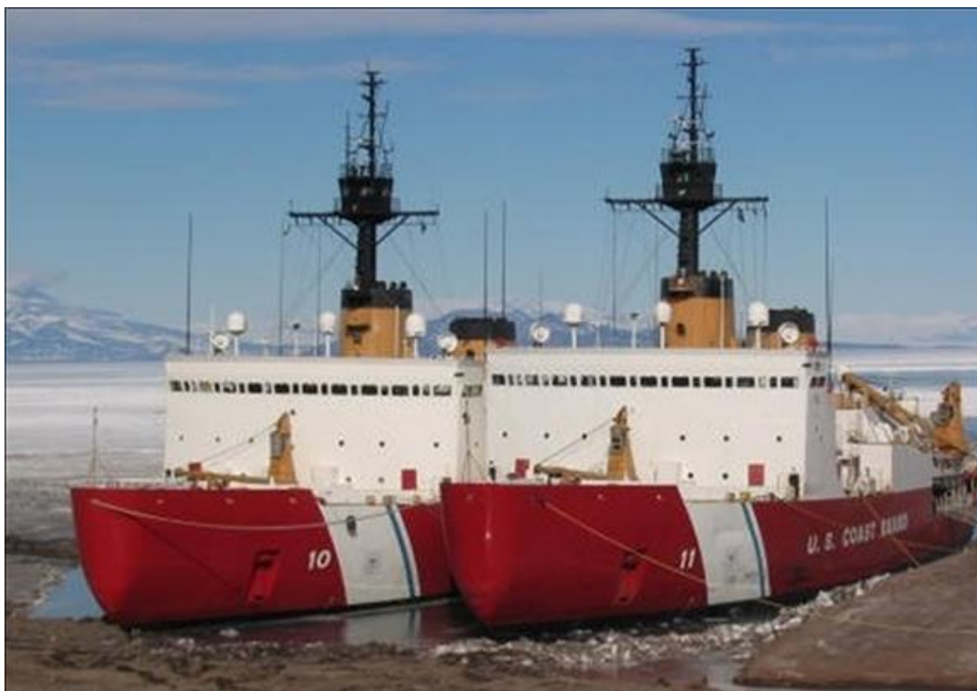
Figure A-1. Polar Star and Polar Sea (Side by side in McMurdo Sound, Antarctica)

Source: Coast Guard photograph that was accessed on April 21, 2011, at http://www.uscg.mil/pacarea/cgcpolarsea/history.asp (link no longer active). The photograph accompanies Kyung M. Song, “Senate Passes Cantwell Measure to Postpone Scrapping of Polar Sea Icebreaker,” Seattle Times , September 22, 2012, posted at http://blogs.seattletimes.com/politicsnorthwest/2012/09/22/senate-passes-cantwell-measure-to-postpone-scrapping-of-polar-sea-icebreaker/ .