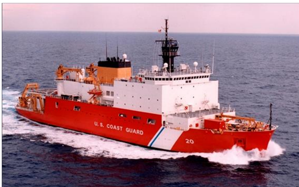
Figure A-3. Healy