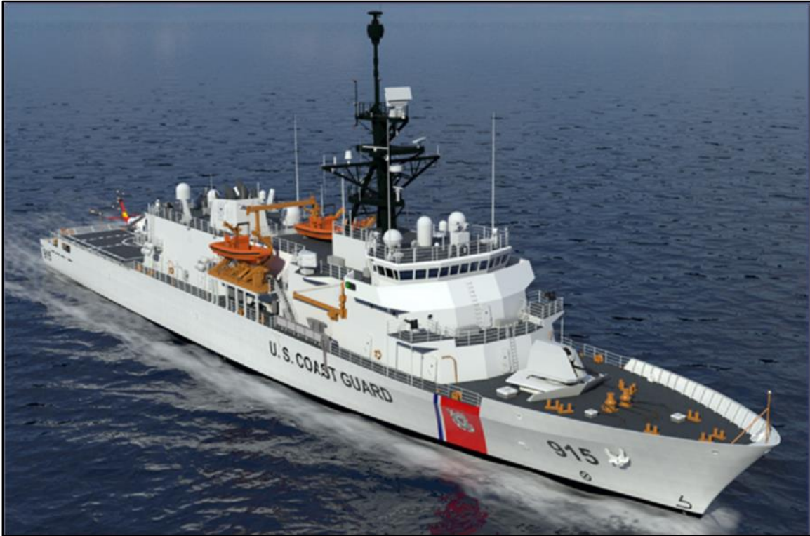
Figure 3. Offshore Patrol Cutter Artist's rendering

Source: Photograph accompanying Kirk Moore, "Coast Guard's Birthday Present: Naming the Next Cutters," WorkBoat , August 4, 2017. A caption to the rendering credits the rendering to Eastern Shipbuilding Group.