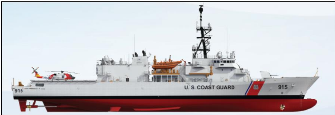
Figure 4. Offshore Patrol Cutter Artist's rendering