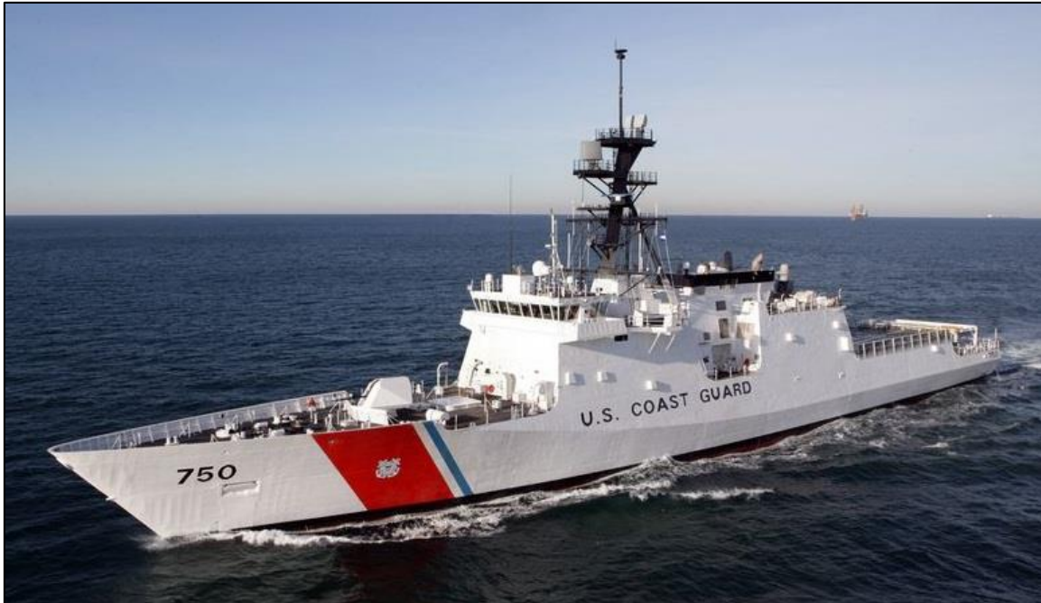
Figure 2. National Security Cutter

Source: Cropped version of photograph accompanying Huntington Ingalls Industries, “Bertholf (WMSL 750) Builder’s Trials,” March 22, 2019. The caption to the photograph states that it was taken on December 4, 2007.