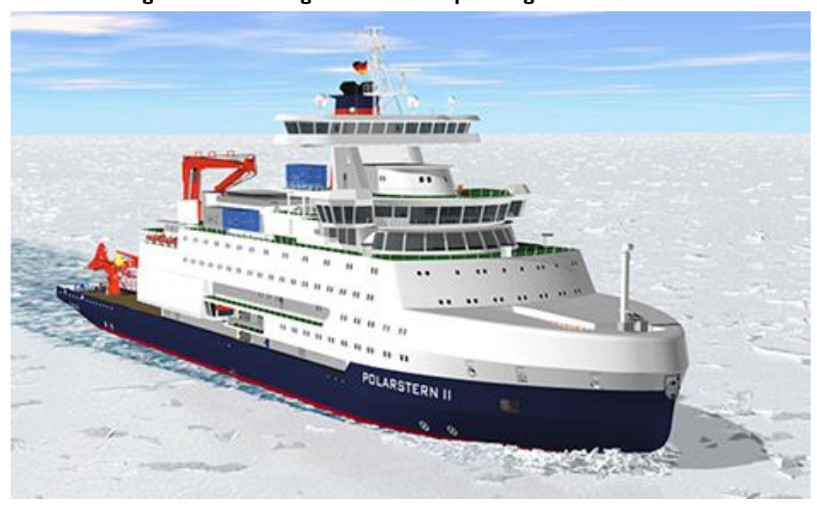
Figure 5. Rendering of SDC Concept Design for Polarstern II

The German icebreaker design referred to in VT Halter's press release, Polar Stern II (also spelled Polarstern II ) ( Figure 5 ),<sup>22</sup> was to be built as the replacement for Polarstern , Germany's current polar research and supply icebreaker. On February 14, 2020, however, the Alfred Wegener Institute, Helmholtz Centre for Polar and Marine Research, announced that "the [German] Federal Ministry of Education and Research (BMBF) today cancelled the Europe-wide call for tenders for the procurement of a new polar research vessel, Polarstern II, for legal reasons."<sup>23</sup>