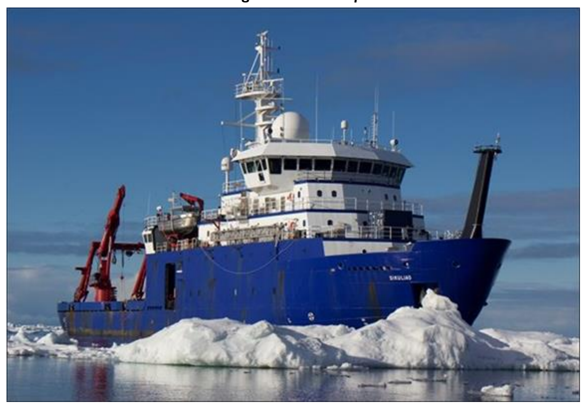
Figure A-6. Sikuliag

Sikuliaq (see-KOO-lee-auk; Figure A-6 ), which is used for scientific research in polar areas, was built by Marinette Marine of Marinette, WI, and entered service in 2015. It is operated for NSF by the College of Fisheries and Ocean Sciences at the University of Alaska Fairbanks as part of the U.S. academic research fleet through the University National Oceanographic Laboratory System (UNOLS). Sikuliaq is 261 feet long and has a displacement of about 3,600 tons. It has a crew of 22 and can embark an additional 26 scientists and students. The ship can break ice 2½ or 3 feet thick at speeds of 2 knots. The ship is considered less an icebreaker than an ice-capable research ship.