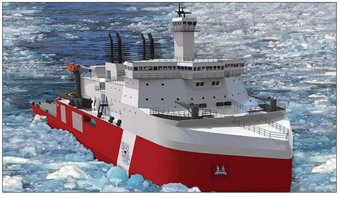
Figure 4. Rendering of VT Halter Design for PSC

Source: Technology Associates, Inc. (cropped version of rendering posted at http://www.navalarchitects.us/pictures.html, accessed June 10, 2020). A similar image was included in VT Halter press release, "VT Halter Marine Awarded the USCG Polar Security Cutter," May 7, 2019, accessed May 8, 2019, at http://www.vthm.com/public/files/20190507.pdf.