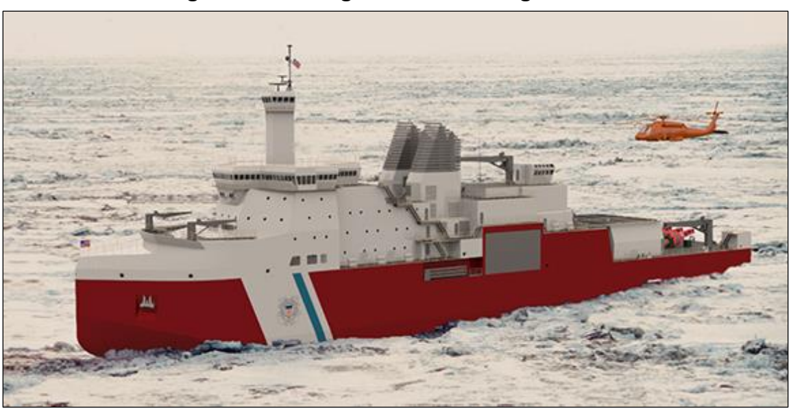
Figure 3. Rendering of VT Halter Design for PSC

Source: Technology Associates, Inc. (cropped version of rendering posted at http://www.navalarchitects.us/pictures.html, accessed June 10, 2020). A similar image was included in VT Halter press release, "VT Halter Marine Awarded the USCG Polar Security Cutter," May 7, 2019, accessed May 8, 2019, at http://www.vthm.com/public/files/20190507.pdf.