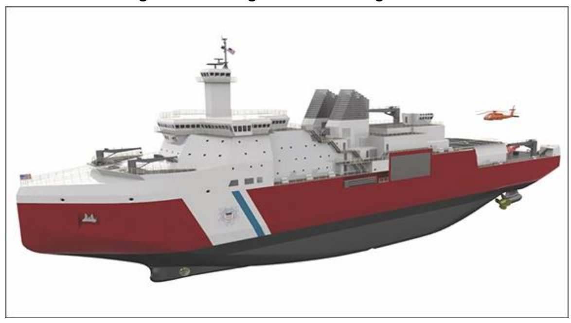
Figure 1. Rendering of VT Halter Design for PSC

Source: Illustration accompanying Sam LaGrone, "UPDATED: VT Halter Marine to Build New Coast Guard Icebreaker," USNI News, April 23, 2019, updated April 24, 2019. The caption to the illustration states "An artist's rendering of VT Halter Marine's winning bid for the U.S. Coast Guard Polar Security Cutter. VT Halter Marine image used with permission."