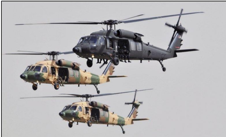
Figure 5. U.S.-Supplied Black Hawk Helicopters for Jordan

FMF overseen by the State Department is designed to support the Jordanian armed forces’ multiyear (usually five-year) procurement plans, while DOD-administered security assistance supports ad hoc defense systems to respond to immediate threats and other contingencies. FMF may be used to purchase new equipment (e.g., precision-guided munitions, night vision) or to sustain previous acquisitions (e.g., Blackhawk helicopters, AT-802 fixed-wing aircraft). FMF grants have enabled the Royal Jordanian Air Force to procure munitions for its F-16 fighter aircraft and a fleet of 31 UH-60 Blackhawk helicopters. 87