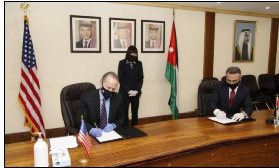
Figure 4.U.S., Jordan Sign Aid Agreement ($340 million assistance agreement signed May 2020)

The U.S. State Department estimates that, since large-scale U.S. aid to Syrian refugees began in FY2012, it has allocated more than $1.8 billion in humanitarian assistance from global accounts for programs in Jordan to meet the needs of Syrian refugees and, indirectly, to ease the burden on Jordan. 83 U.S. humanitarian assistance is provided both as cash assistance to refugees and through programs to meet their basic needs, such as child health care, education, water, and sanitation. To help prevent the spread of COVID-19 in Jordan, the United States has provided $8.4 million in aid, most of which is targeted toward Syrian refugees living in Jordan. 84