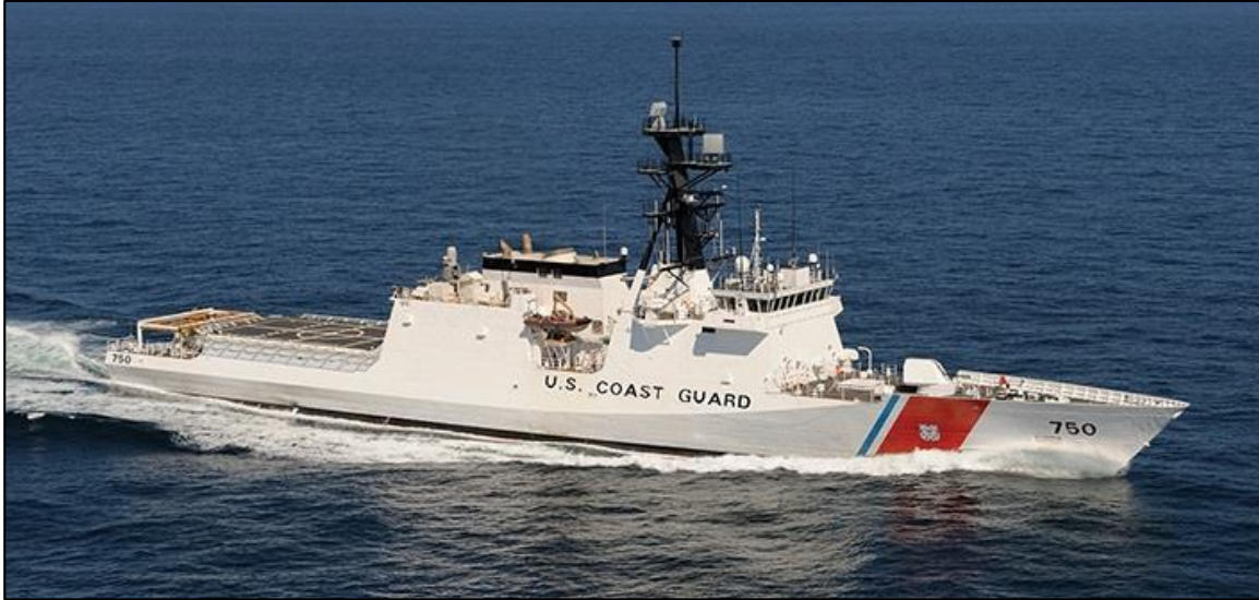
Figure 1. National Security Cutter