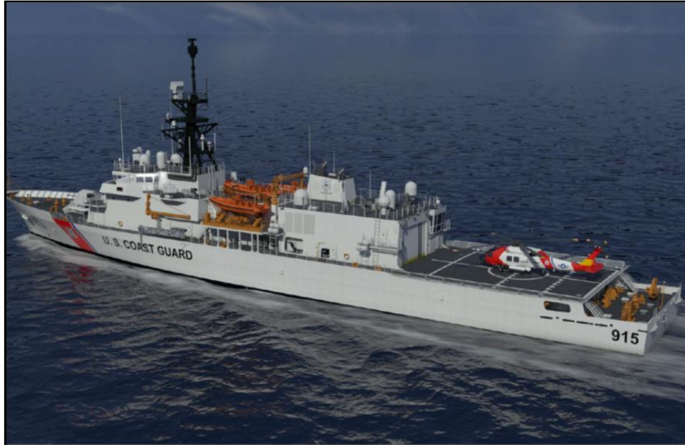
Figure 5. Offshore Patrol Cutter Artist's rendering