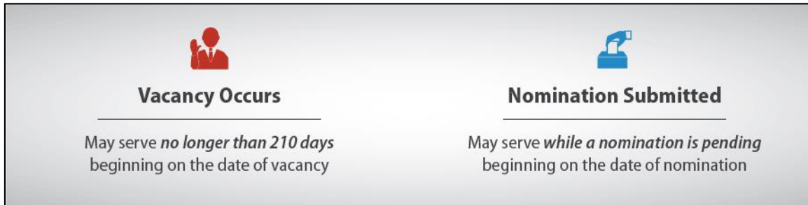
Figure I. Two Limited Periods of Service

The Vacancies Act generally limits the amount of time that a vacant advice-and-consent position may be filled by an acting officer. 120 Section 3346 provides that a person may serve “for no longer than 210 days beginning on the date the vacancy occurs,” or, “once a first or second nomination for the office is submitted to the Senate, from the date of such nomination for the period that the nomination is pending in the Senate.” 121 These two periods run independently and concurrently. 122 Consequently, the submission and pendency of a nomination allow an acting officer to serve beyond the initial 210-day period. 123