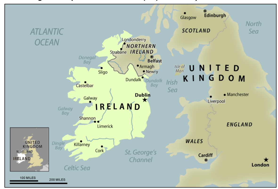
Figure 1. Map of Northern Ireland (UK) and the Republic of Ireland

Successive U.S. Administrations and many Members of Congress have actively supported the Northern Ireland peace process and encouraged the full implementation of the Good Friday Agreement, as well as subsequent accords and initiatives to further the peace process and promote long-term reconciliation. Some Members have been particularly interested in police reforms and human rights in Northern Ireland. Since 1986, the United States has provided development aid through the International Fund for Ireland (IFI) as a means to encourage economic development and foster reconciliation. Some Members of Congress also have demonstrated an interest in how Brexit will affect Northern Ireland in the years ahead.