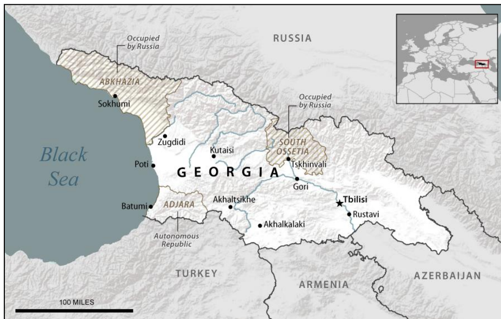
Figure 3. Georgia