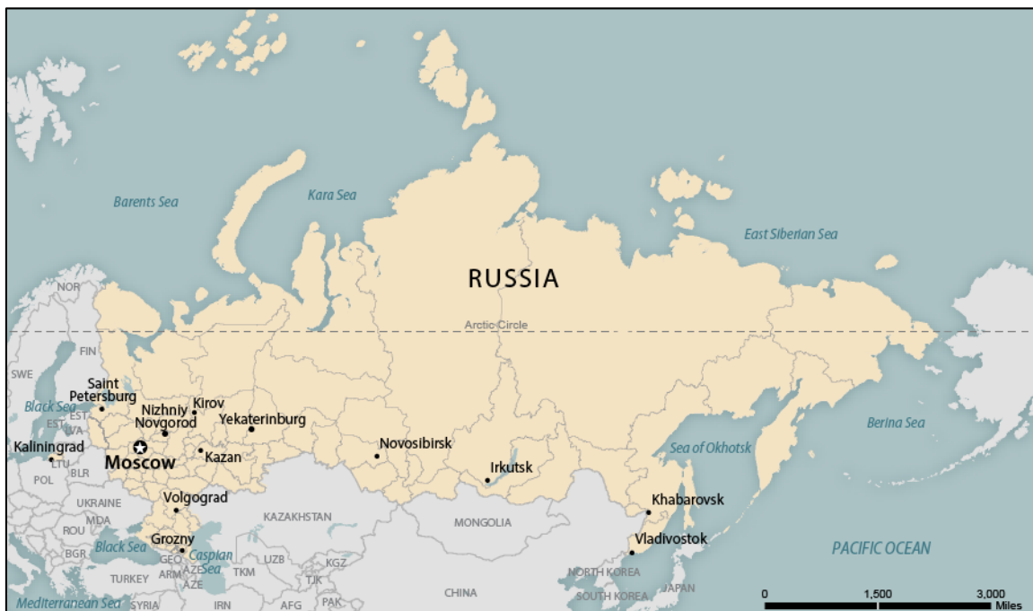
Figure I. Russian Federation