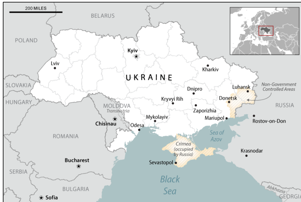
Figure 2. Ukraine