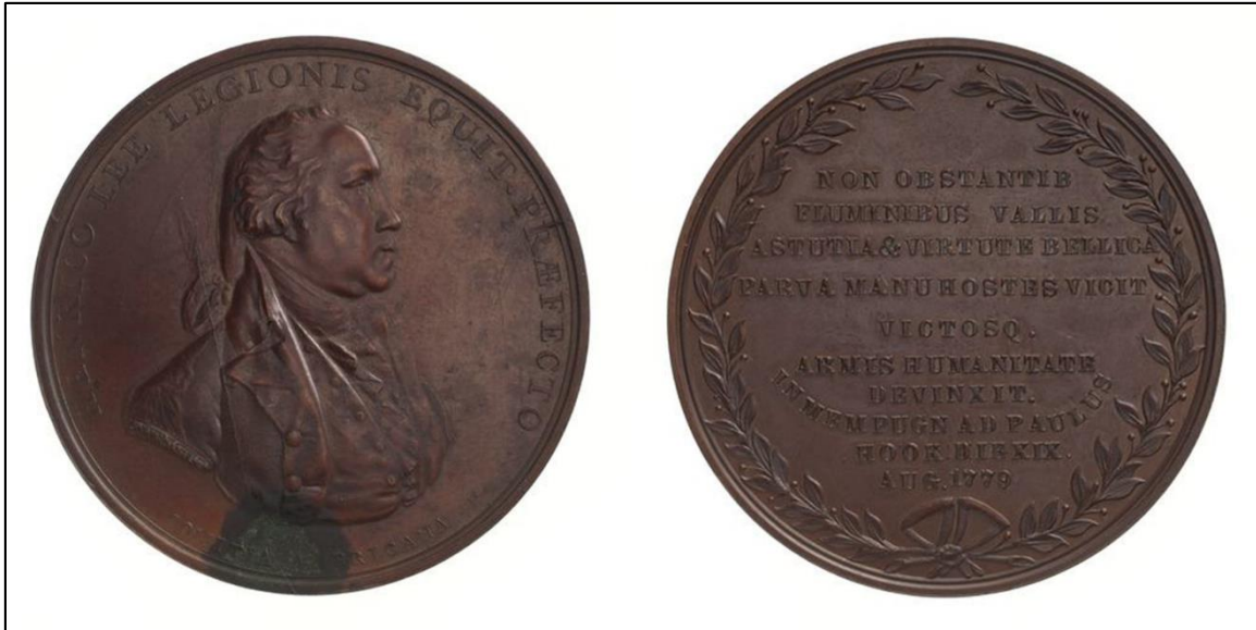
Figure 1. Major Henry Lee Congressional Gold Medal

Source: Museums Victoria (AUS) “Medal – Congressional Medal, Henry Lee, United States,” Item NU 36568, at https://collections.museumsvictoria.com.au/items/138292 .