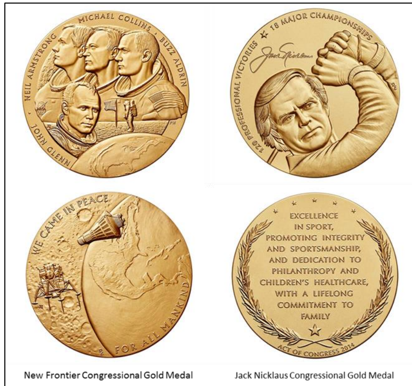
Figure 3. Recent Examples of Congressional Gold Medal Design