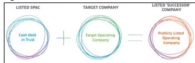
Figure 2. How Does a SPAC Work?

fair market value of at least 80% of the value of the escrow account within 36 months. If the acquisitions cannot be completed within that time, the SPAC must file for an extension or return the funds to investors. At the time of the de-SPAC transaction, the combined company also must meet stock exchange listing requirements for an operating company. The NASDAQ and the New York Stock Exchange are two common exchanges for SPAC listings.