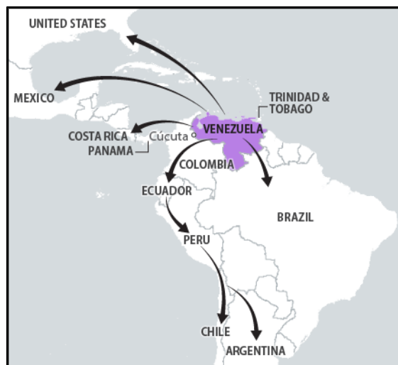
Figure 3. Venezuelan Migrants and Asylum Seekers: Flows to the Region and Beyond