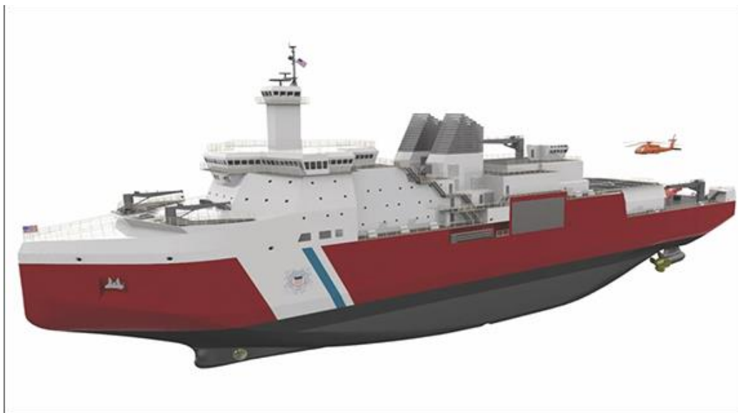
Figure 1. Rendering of VT Halter Design for PSC