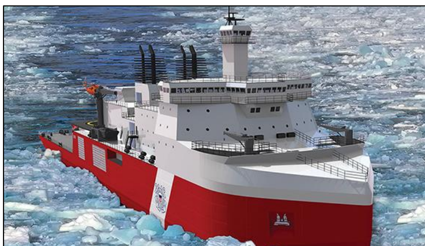
Figure 4. Rendering of VT Halter Design for PSC