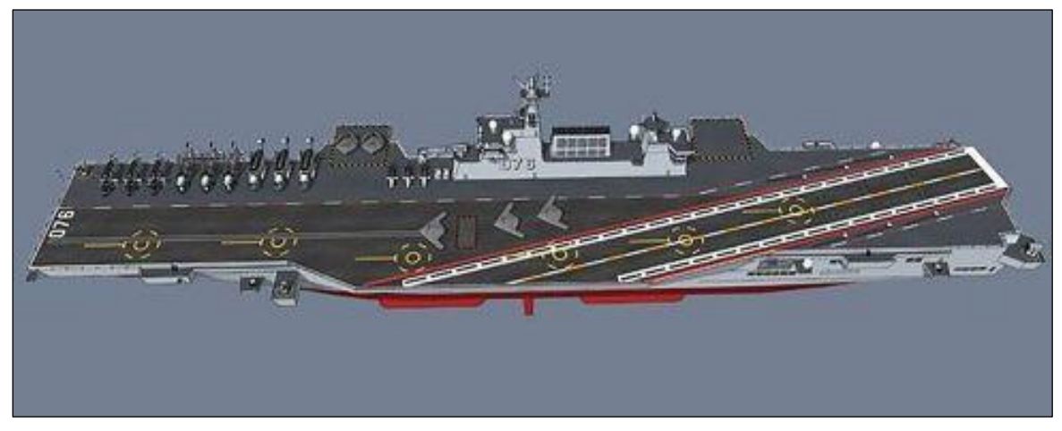
Figure 23. Notional Rendering of Possible Type 076 Amphibious Assault Ship