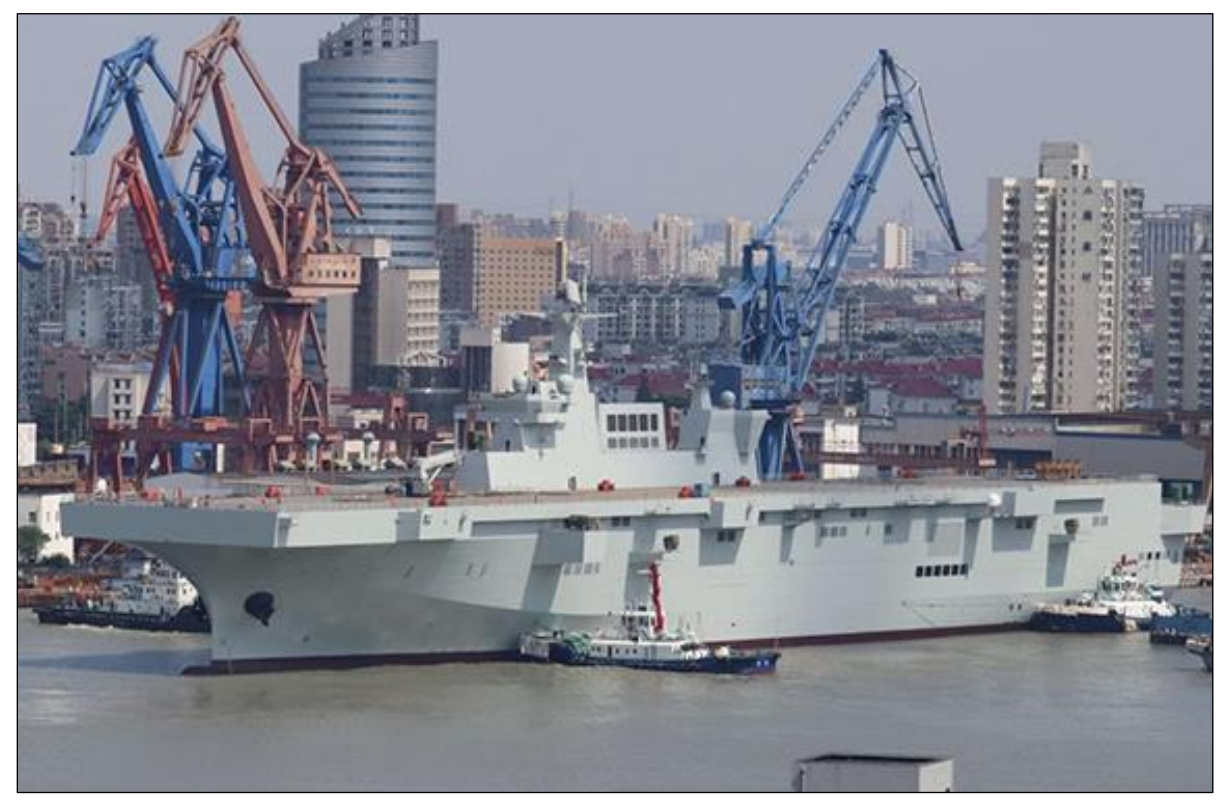
Figure 19. Type 075 Amphibious Assault Ship

China reportedly launched the second Type 075 ship, on April 22, 2020,<sup>73</sup> and the third on January 29, 2021.<sup>74</sup>