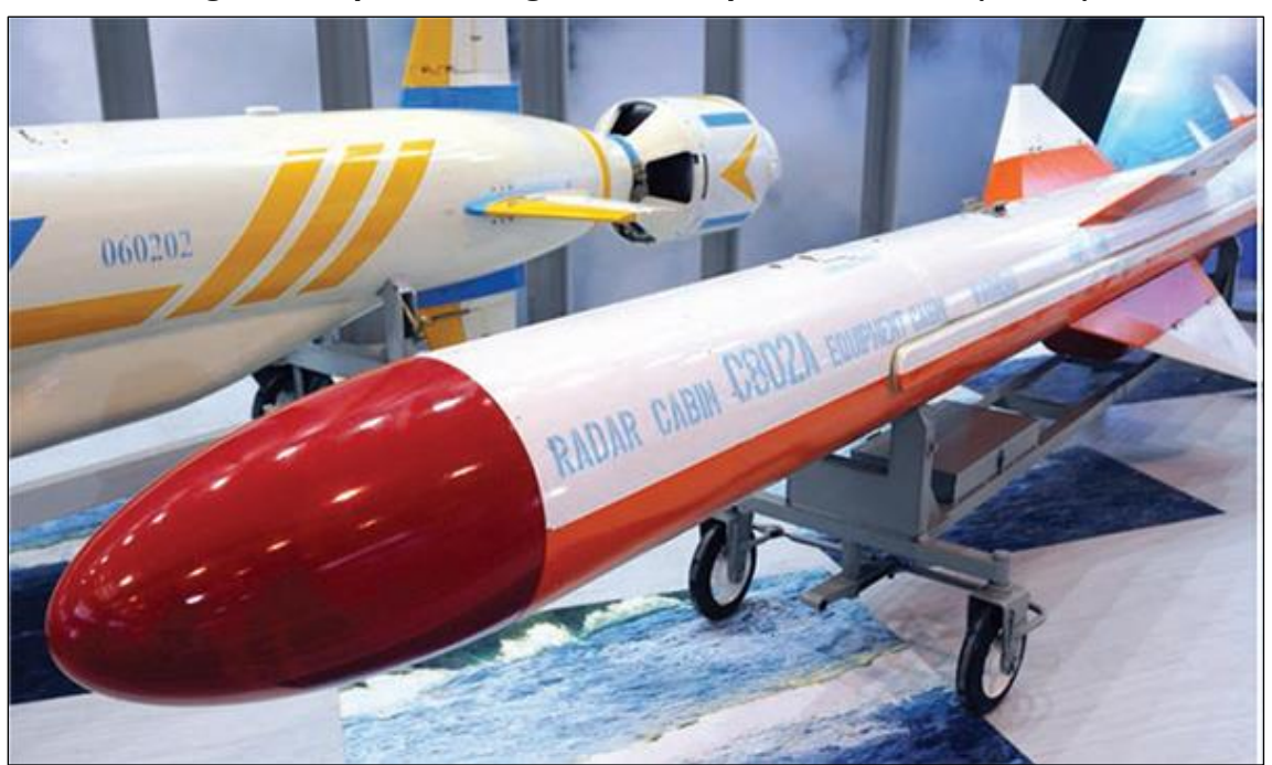
Figure 5. Reported Image of Anti-Ship Cruise Missile (ASCM)