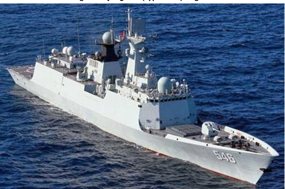
Figure 16. Jiangkai II (Type 054A) Frigate