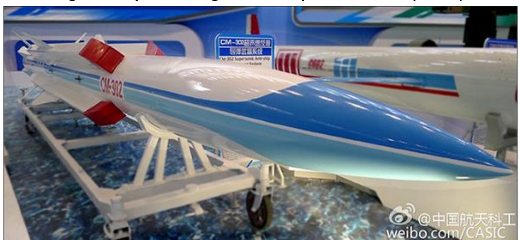
Figure 3. Reported Image of Anti-Ship Cruise Missile (ASCM)

Source: Detail of photograph accompanying Pierre Delrieu, "China Promotes Export of CM-302 Supersonic ASCM," Asian Military Review , July 3, 2017. (The article states "This is an article published in our December 2016 Issue.") The article states "According to Chinese news media reports, the China Aerospace Science and Industry Corporation(CASIC) CM-302 missile is being marketed for export as "the world's best anti-ship missile." The missile was showcased at the Zhuhai air show in the southern People's Republic of China (PRC) in early November [2016], and is advertised as [a] supersonic Anti-Ship Missile (AShM) [ASCM] which can also be used in the land attack role. The report, published by the national newspaper China Daily , suggest[s] that the CM-302 is the export version of CASIC's YJ-12 supersonic AShM, which is in service with the PRC's armed forces.")