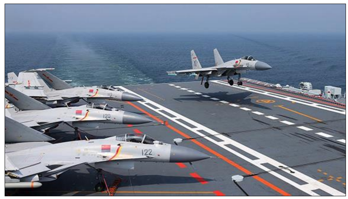
Figure 12. J-15 Flying Shark Carrier-Capable Fighter

of its J-20 fifth-generation stealth fighter and/or a carrier-capable variant of its FC-31 fifthgeneration stealth fighter to complement or succeed the J-15 on catapult-equipped Chinese carriers.<sup>46</sup> China reportedly is also developing a carrier-based airborne early warning (AEW) aircraft, called the KJ-600, that is similar to the U.S. Navy's carrier-based E-2 Hawkeye AEW aircraft,<sup>47</sup> and stealth drone aircraft.<sup>48</sup>