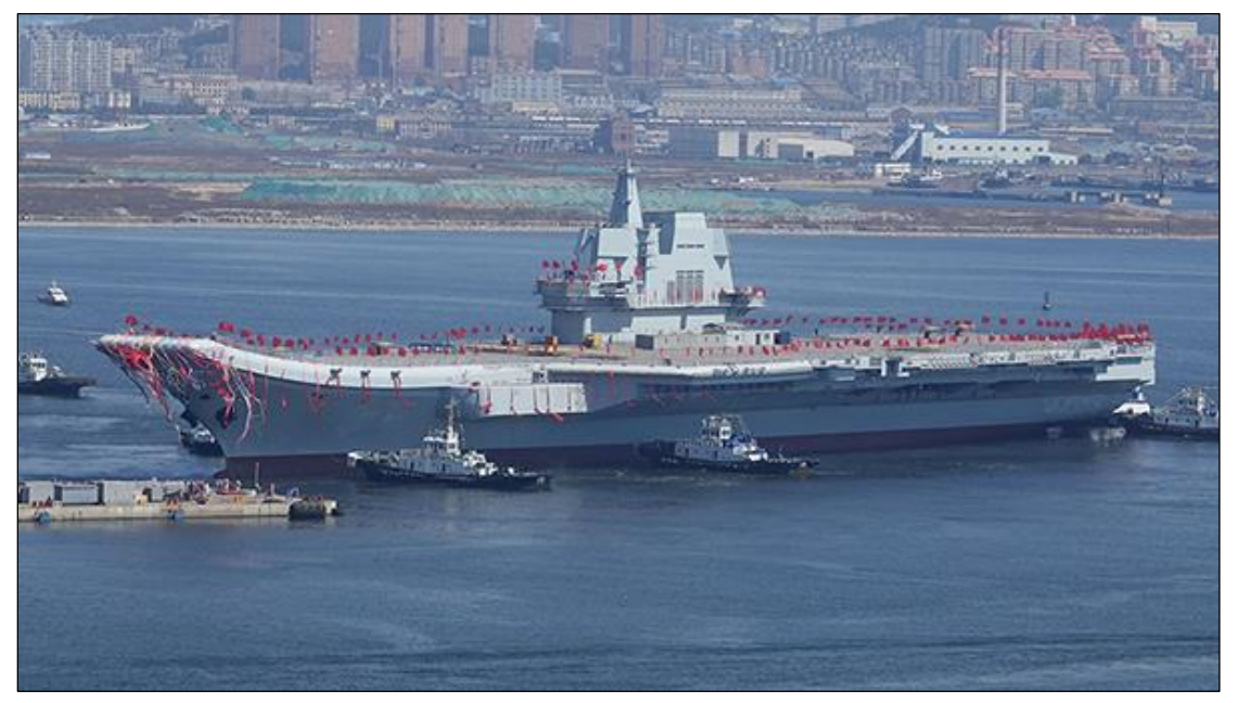
Figure 10. Shandong (Type 002) Aircraft Carrier

technical considerations. Observers expect that it will be some time before China masters carrierbased aircraft operations on a substantial scale.