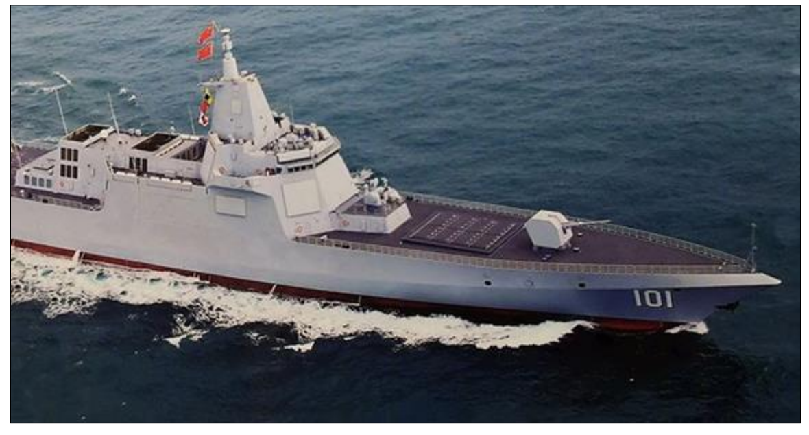
Figure 14. Renhai (Type 055) Cruiser (or Large Destroyer)

that the eighth ship in the class was launched on August 30, 2020,<sup>59</sup> and that the eighth ship "will complete the first group of Type 055 destroyers."<sup>60</sup>