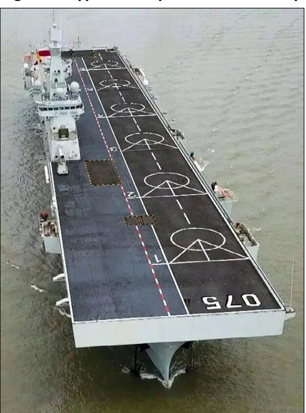
Figure 20. Type 075 Amphibious Assault Ship