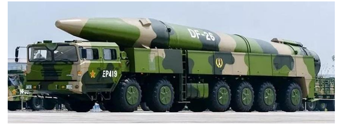
Figure 2. DF-26 Multi-Role Intermediate-Range Ballistic Missile (IRBM)

developing hypersonic glide vehicles that, if incorporated into Chinese ASBMs, could make Chinese ASBMs more difficult to intercept.<sup>24</sup>