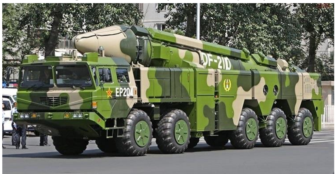
Figure I. DF-21D Anti-Ship Ballistic Missile (ASBM)

China reportedly is fielding two types of land-based ballistic missiles with a capability of hitting ships at sea—the DF-21D ( Figure 1 ), a road-mobile anti-ship ballistic missile (ASBM) with a range of more than 1,500 kilometers (i.e., more than 910 nautical miles), and the DF-26 ( Figure 2 ), a road-mobile, multi-role intermediate range ballistic missile (IRBM) with a maximum range of about 4,000 kilometers (i.e., about 2,160 nautical miles) that DOD says "is capable of conducting both conventional and nuclear precision strikes against ground targets as well as conventional strikes against naval targets."<sup>21</sup>