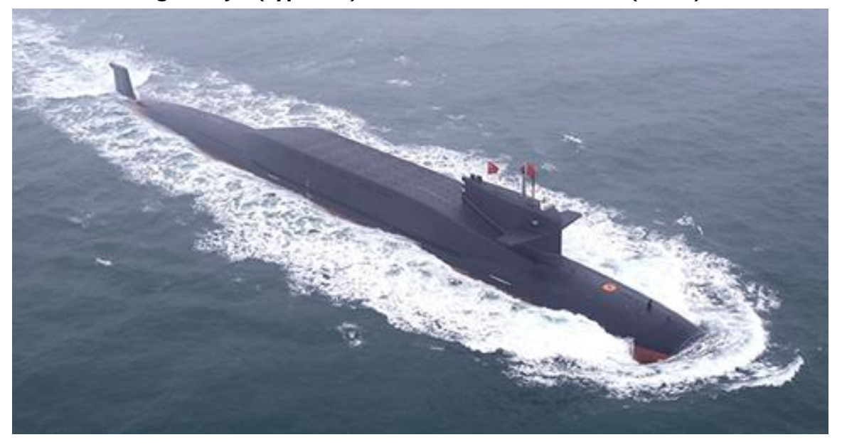
Figure 8. Jin (Type 094) Ballistic Missile Submarine (SSBN)

ships to decoy. Each Jin-class SSBN is armed with 12 JL-2 nuclear-armed submarine-launched ballistic missiles (SLBMs).<sup>32</sup>