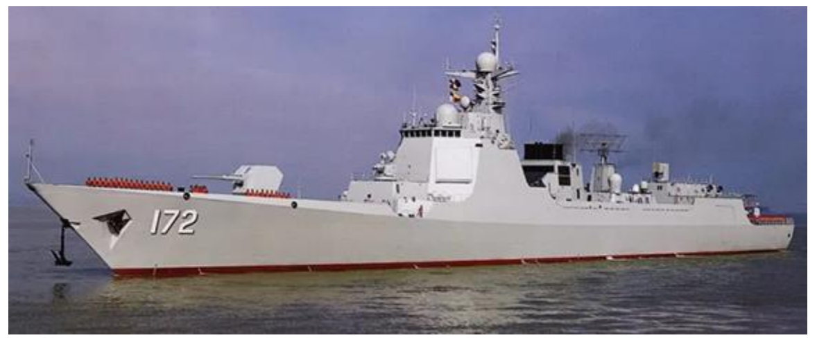
Figure 15. Luyang III (Type 052D) Destroyer

of the Type 052D, informally called the Type 052DL, that incorporates an extended-length helicopter flight deck and a new radar.<sup>63</sup>