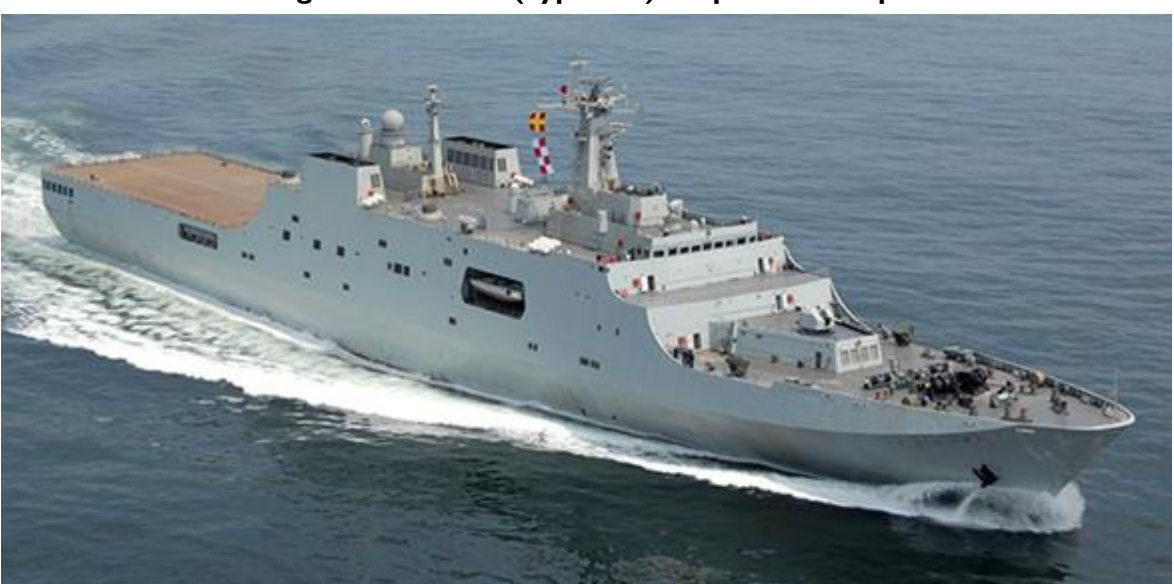
Figure 18. Yuzhao (Type 071) Amphibious Ship