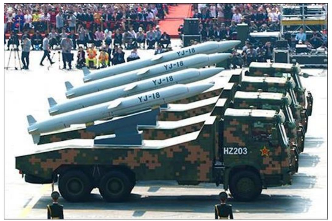
Figure 4. Reported Image of Anti-Ship Cruise Missile (ASCM)

Source: Detail of photograph accompanying Pierre Delrieu, "China Promotes Export of CM-302 Supersonic ASCM," Asian Military Review , July 3, 2017. (The article states "This is an article published in our December 2016 Issue.") The article states "According to Chinese news media reports, the China Aerospace Science and Industry Corporation(CASIC) CM-302 missile is being marketed for export as "the world's best anti-ship missile." The missile was showcased at the Zhuhai air show in the southern People's Republic of China (PRC) in early November [2016], and is advertised as [a] supersonic Anti-Ship Missile (AShM) [ASCM] which can also be used in the land attack role. The report, published by the national newspaper China Daily , suggest[s] that the CM-302 is the export version of CASIC's YJ-12 supersonic AShM, which is in service with the PRC's armed forces.")