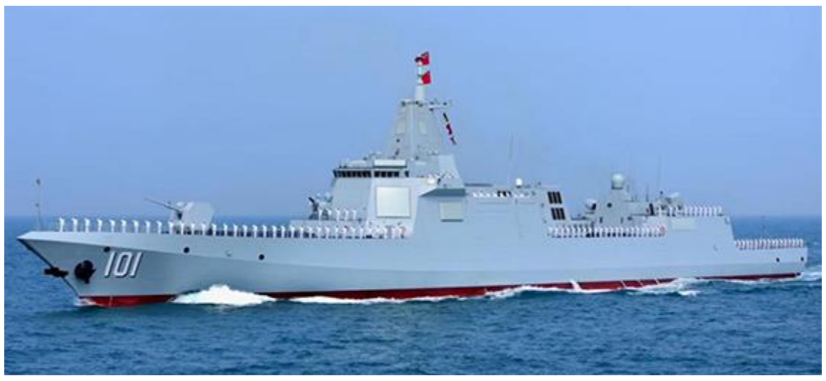
Figure 13. Renhai (Type 055) Cruiser (or Large Destroyer)

7, 2021, press report by a Chinese media outlet states that the ship displaces more than 12,000 tons.<sup>54</sup> By way of comparison, the U.S. Navy's Ticonderoga (CG-47) class cruisers and Arleigh Burke (DDG-51) class destroyers (aka the U.S. Navy's Aegis cruisers and destroyers) displace about 10,100 tons and 9,300 tons, respectively, while the U.S. Navy's three Zumwalt (DDG-1000) class destroyers displace about 15,600 tons.