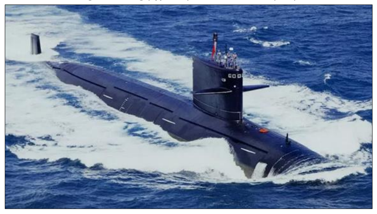
Figure 7. Shang (Type 093) Attack Submarine (SSN)

By the mid-2020s, China will likely build the Type 093B guided-missile nuclear attack submarine. This new Shang class variant will enhance the PLAN's anti-surface warfare capability and could provide a clandestine land-attack option if equipped with land-attack cruise missiles (LACMs)."<sup>31</sup>