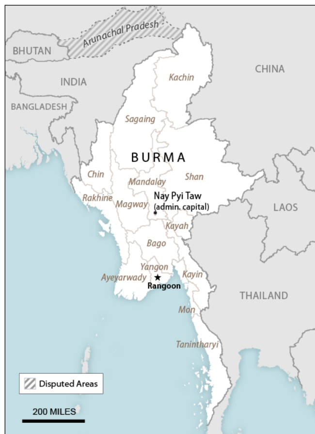
Figure 2. Map of Burma

Other sources posit that the coup occurred after the military's Commander in Chief, Senior General Min Aung Hlaing, failed to convince Aung San Suu Kyi and the NLD to select him as the next President. Under the 2008 constitution, the president is appointed by the Union Parliament. The NLD's victory in the parliamentary elections made his selection as President unlikely.