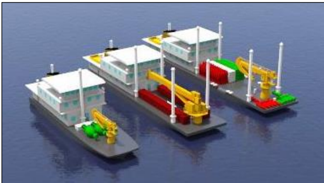
Figure 2. Coast Guard Notional Designs for WLR, WLIC, and WLI