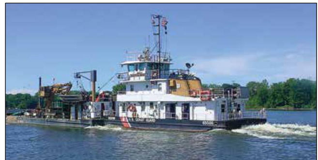
Figure 1. Coast Guard River Buoy Tender (WLR)

As of 2019, the 13 WLICs were based at cities along the U.S. East and Gulf coasts in Alabama, Florida (three cutters), Louisiana (two cutters), Maryland, North Carolina, South Carolina, Texas (three cutters), and Virginia. As of 2019, the four WLIs were based at locations in Alaska, Michigan, Oregon, and North Carolina.