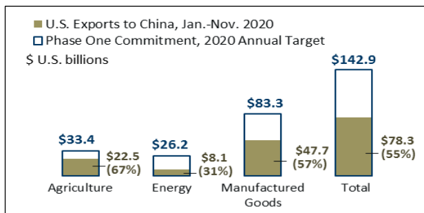
Figure 3. Phase One Trade (January-November 2020)