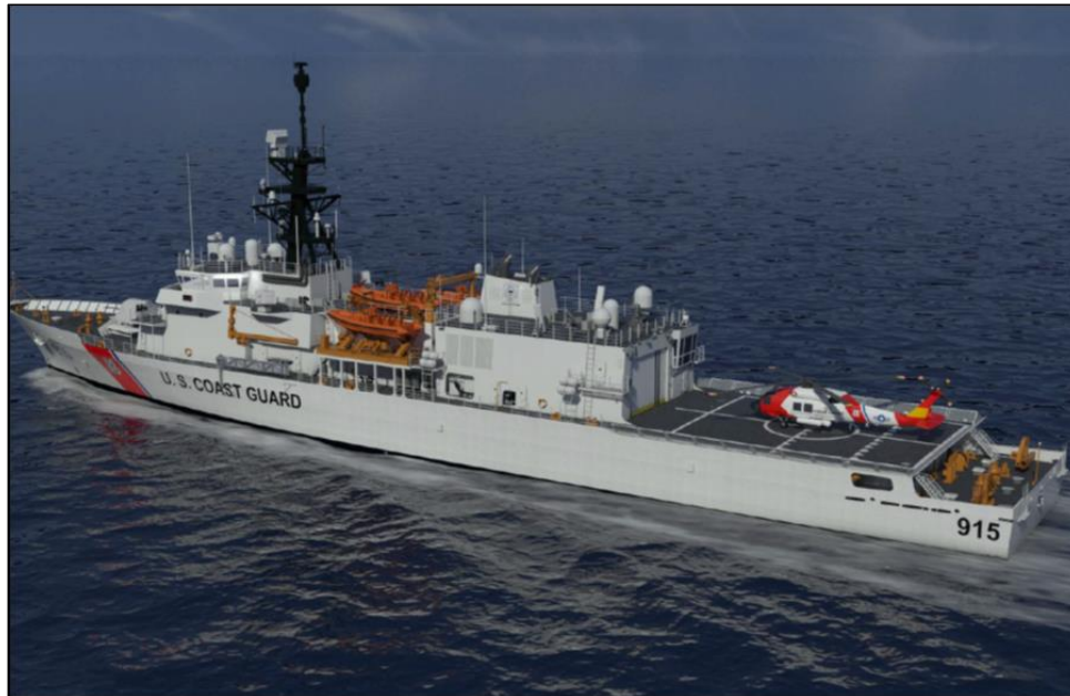
Figure 5. Offshore Patrol Cutter Artist's rendering