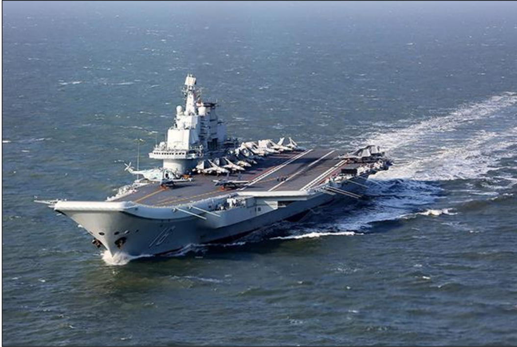
Figure 9. Liaoning (Type 001) Aircraft Carrier