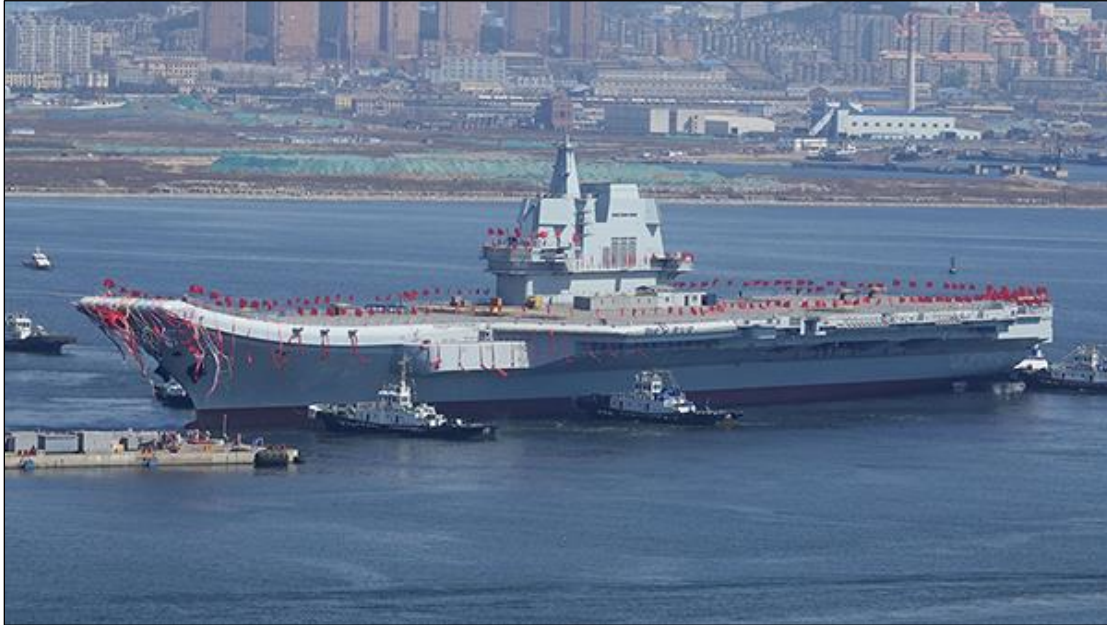
Figure 10. Shandong (Type 002) Aircraft Carrier