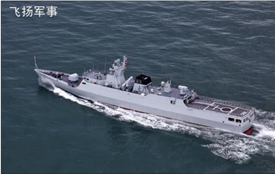
Figure 17. Jingdao (Type 056) Corvette