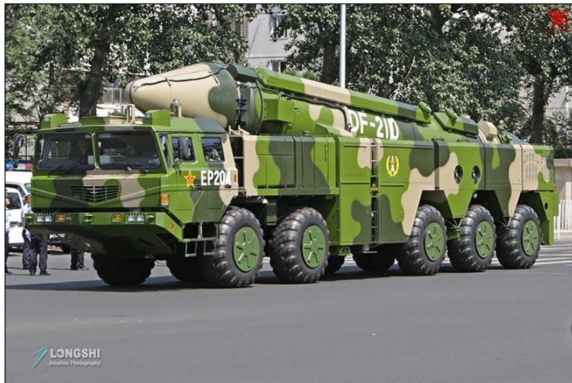
Figure 1. DF-21D Anti-Ship Ballistic Missile (ASBM)