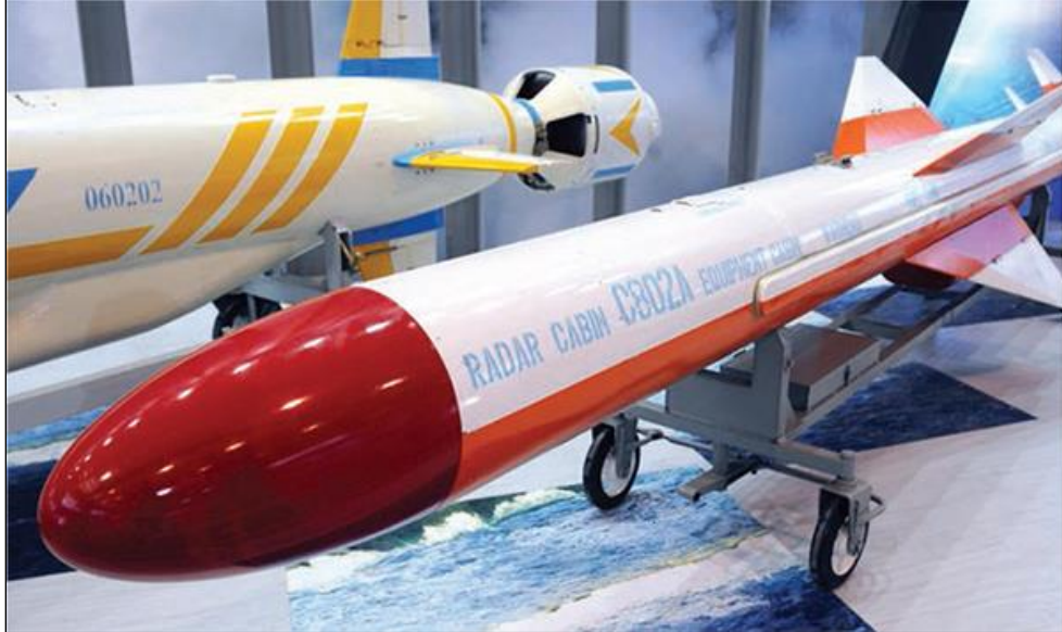
Figure 5. Reported Image of Anti-Ship Cruise Missile (ASCM)