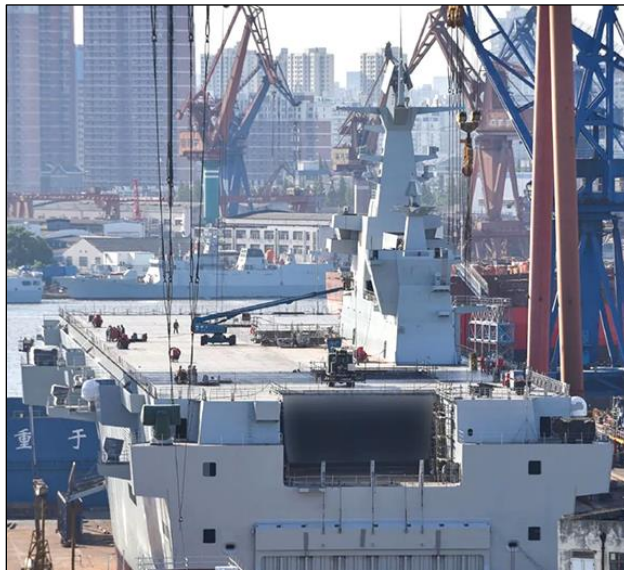
Figure 21. Type 075 Amphibious Assault Ship