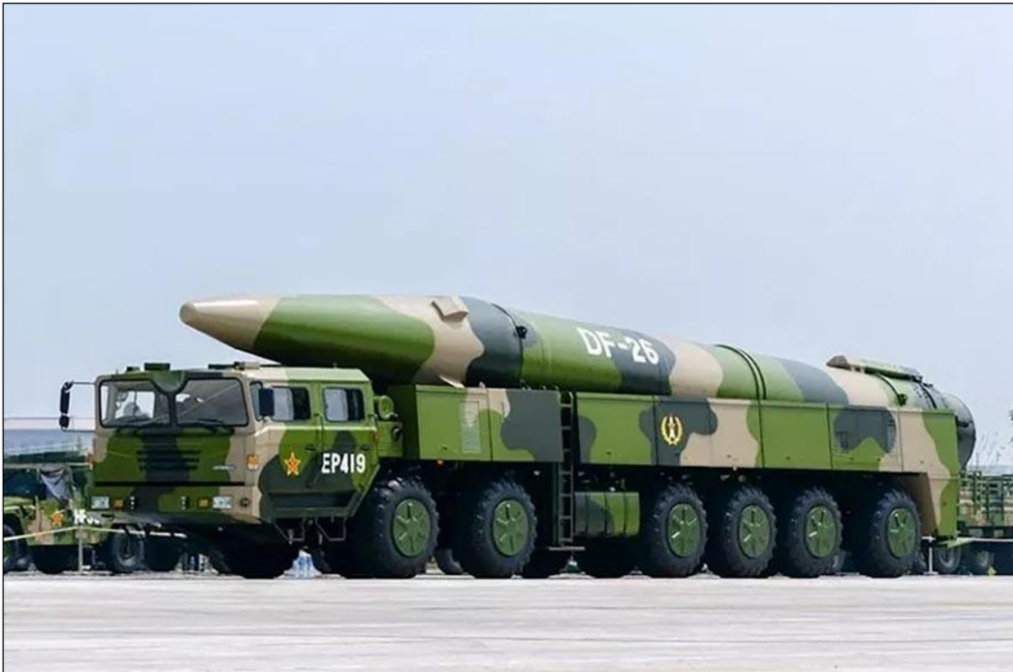
Figure 2. DF-26 Multi-Role Intermediate-Range Ballistic Missile (IRBM)