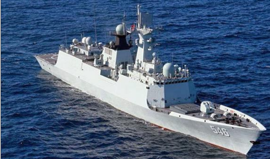
Figure 16. Jiangkai II (Type 054A) Frigate