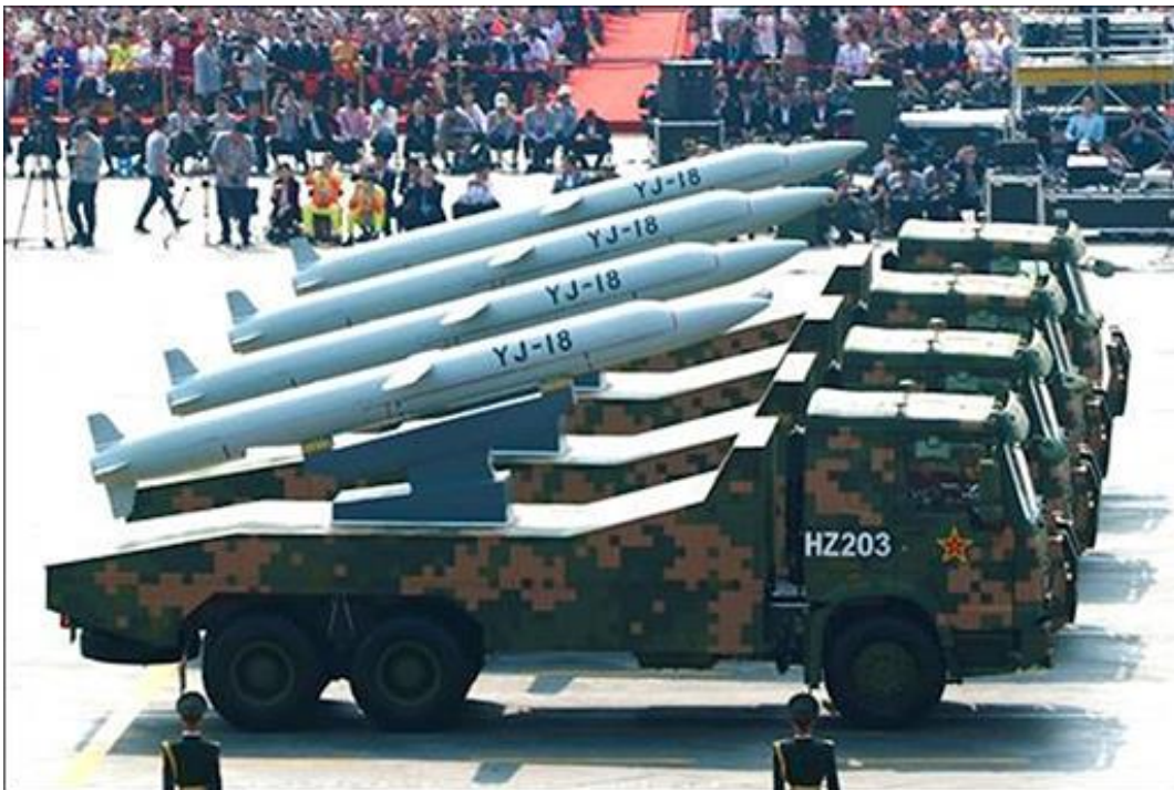
Figure 4. Reported Image of Anti-Ship Cruise Missile (ASCM)

Source: Photograph accompanying “YJ-18 Eagle Strike CH-SS-NX-13,” GlobalSecurity.org, updated October 1, 2019. The article states “A grand military parade was held in Beijing on 01 October 2019 to mark the People’s Republic of China’s 70 th founding anniversary.... One weapon featured was a new generation of anti-ship missiles called YJ-18. China unveiled YJ-18/18A anti-ship cruise missiles in the National Day military parade in central Beijing.”)