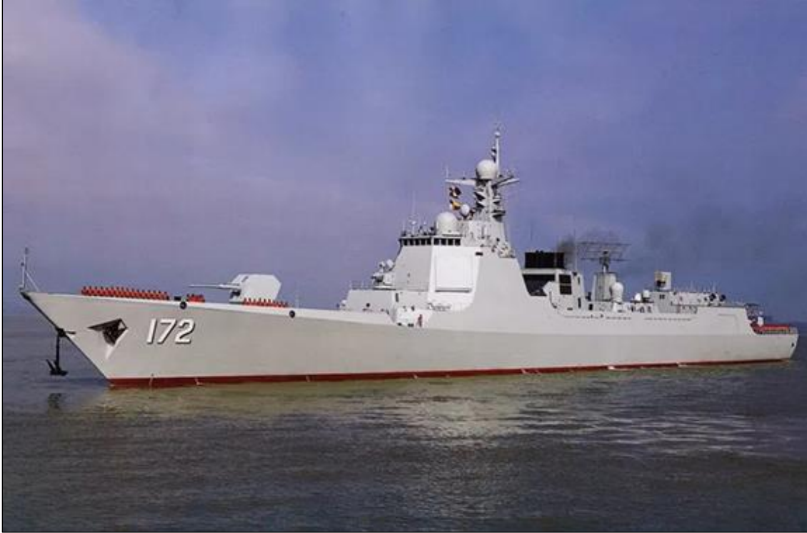
Figure 15. Luyang III (Type 052D) Destroyer