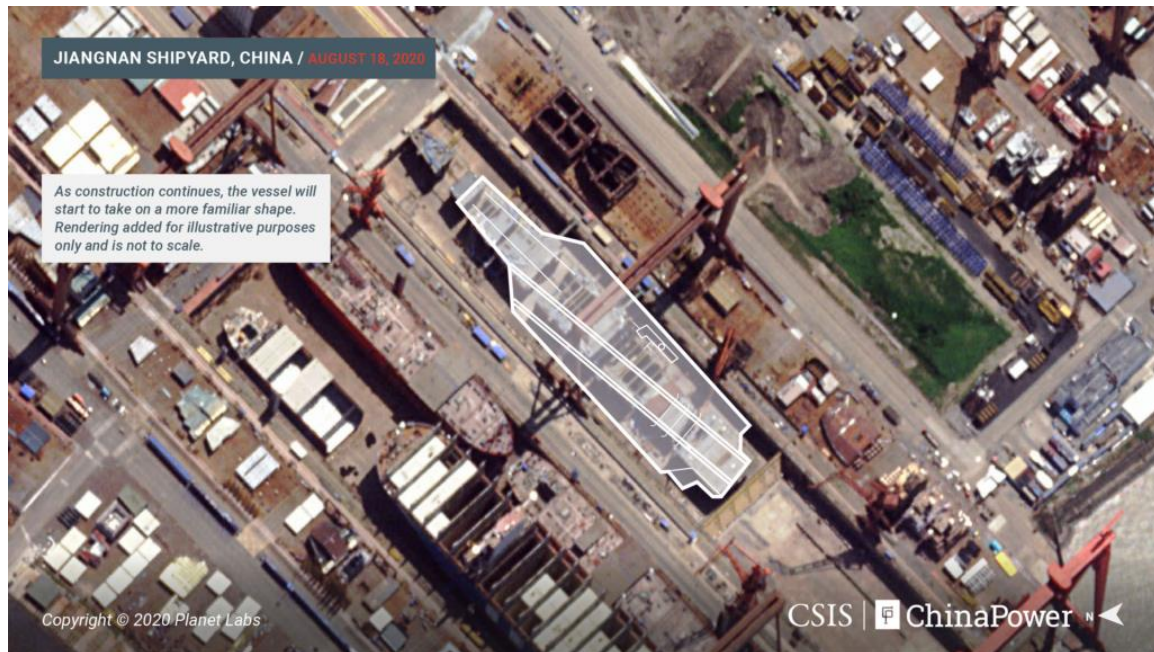
Figure 11. Type 003 Aircraft Carrier Under Construction