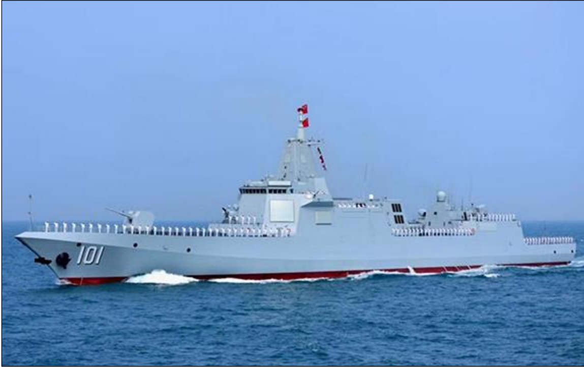
Figure 13. Renhai (Type 055) Cruiser (or Large Destroyer)