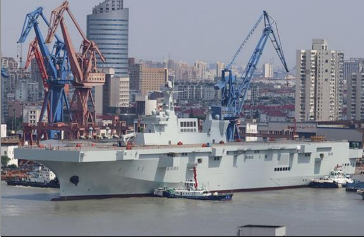
Figure 19. Type 075 Amphibious Assault Ship