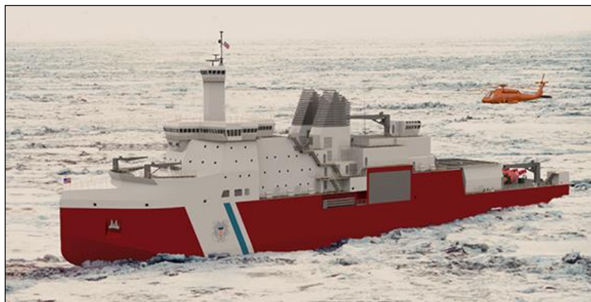
Figure 3. Rendering of VT Halter Design for PSC

A similar image was included in VT Halter press release, “VT Halter Marine Awarded the USCG Polar Security Cutter,” May 7, 2019, accessed May 8, 2019, at http://www.vthm.com/public/files/20190507.pdf .