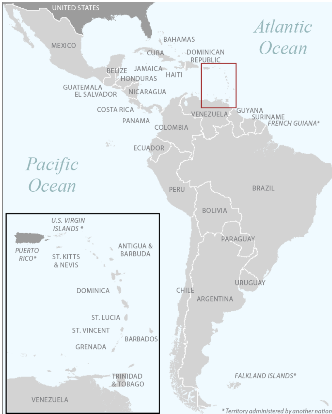
Figure I. Map of Latin America and the Caribbean